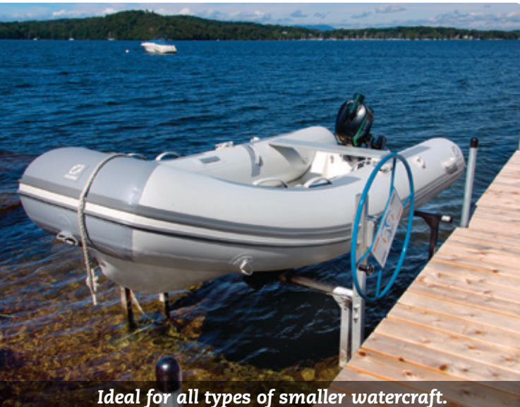
Ideal for all types of smaller watercraft.