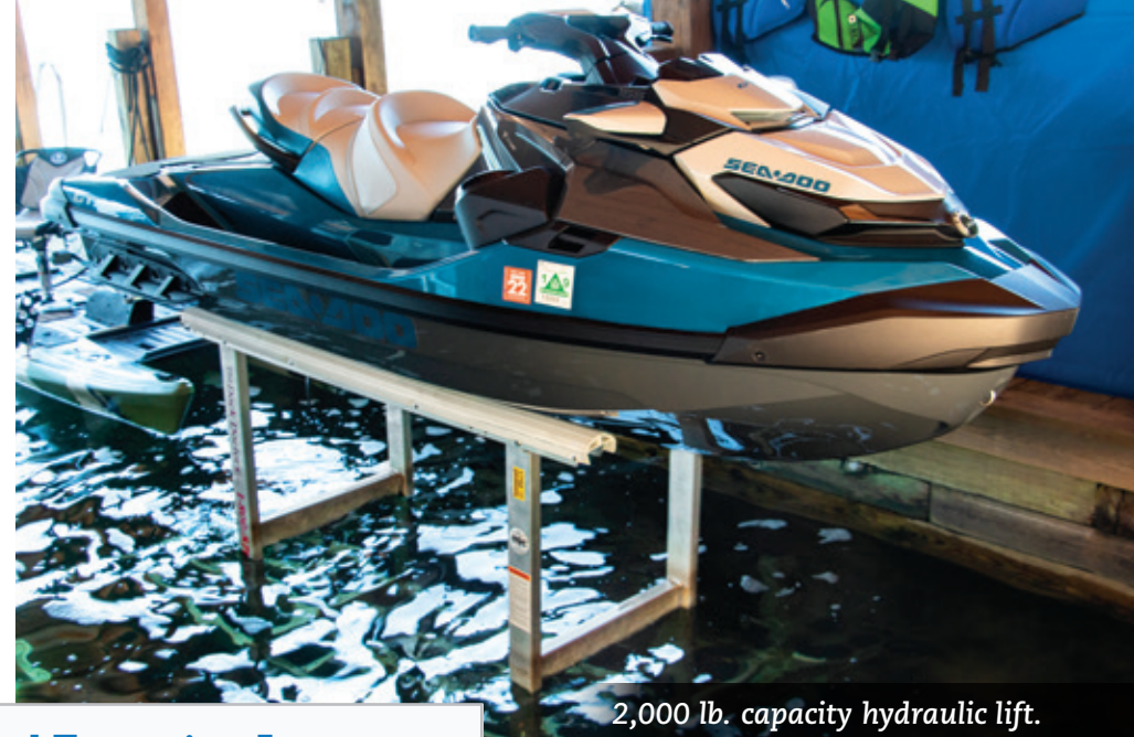
2,000 lb. capacity hydraulic lift.