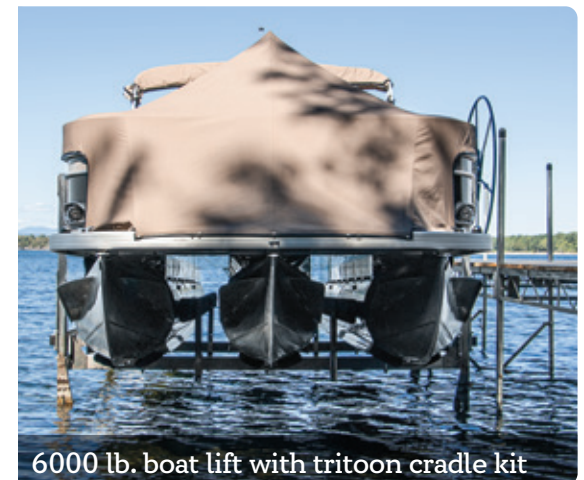
6000 lb. boat lift with tritoon cradle kit