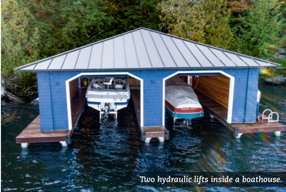
Two hydraulic lifts inside a boathouse.