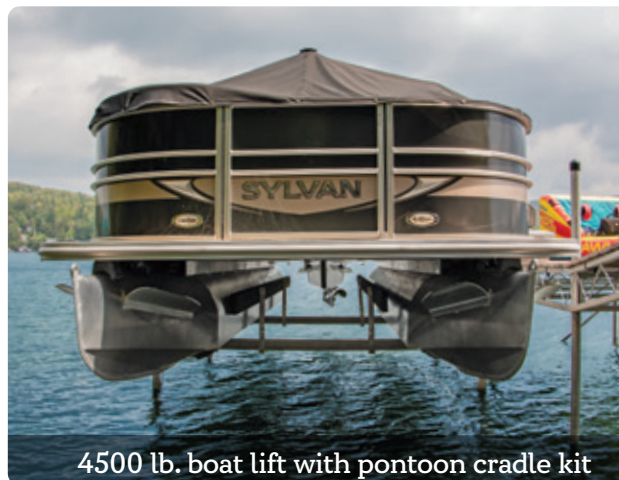
4500 lb. boat lift with pontoon cradle kit

See page 73 for pricing and details on the pontoon and tritoon cradle kits.