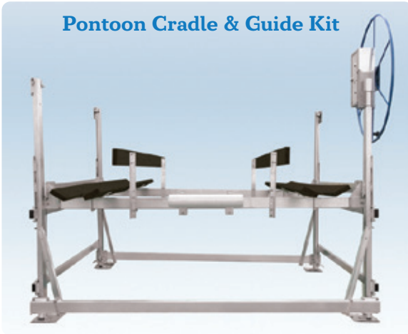
Pontoon Cradle & Guide Kit