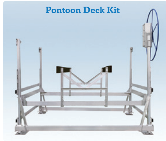
Pontoon Deck Kit