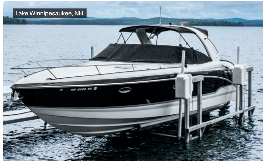
Lake Winnepesaukee, NH