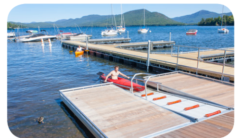
Commercial Dock & Launch Systems