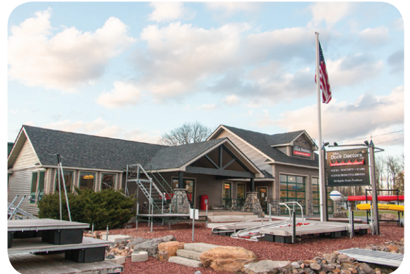
Our showroom and 25,000 sq. ft. state-of-the-art manufacturing facility