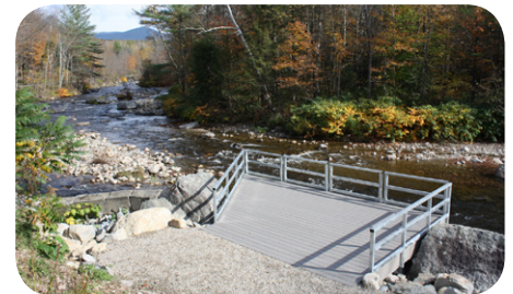
Commercial Fishing Piers