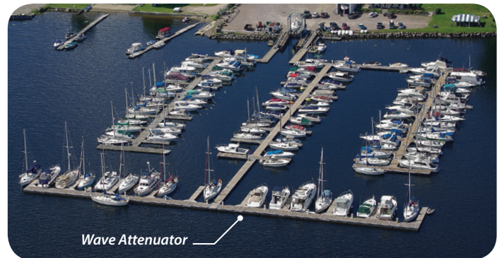
Commercial Floating Docks & Wave Attenuators