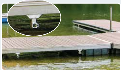
Axle & Wheel Mounts $895/set for seasonal installation & removal