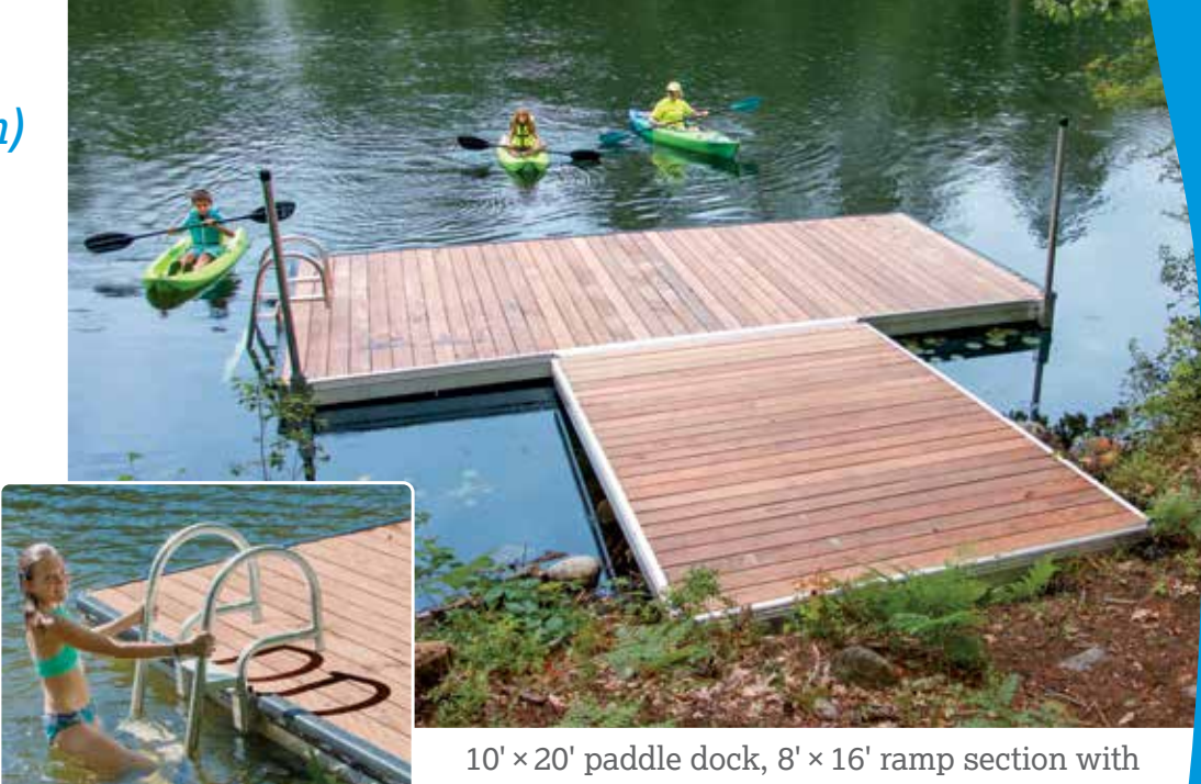
10' \times 20' paddle dock, 8' \times 16' ramp section with Ipe decking and optional angled ladder (inset).