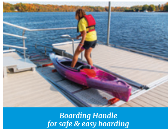
Boarding Handle for safe & easy boarding