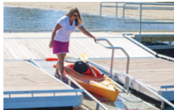
Boarding Handle for safe & easy boarding