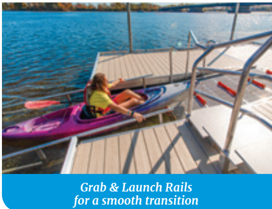
Grab & Launch Rails for a smooth transition