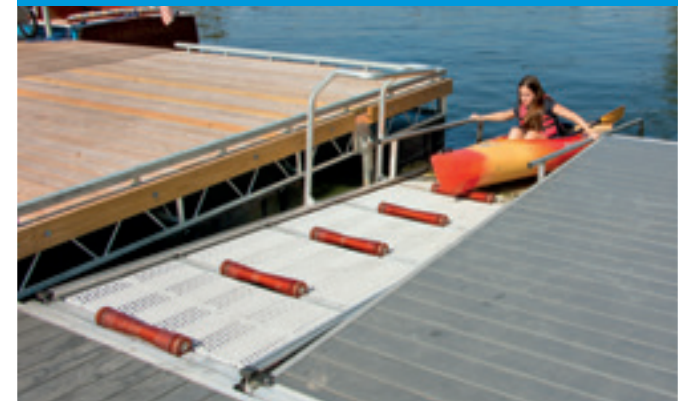
Grab & Launch Rails for a smooth transition