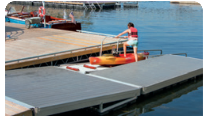
Boarding Handle for safe & easy boarding

Add on kayak/canoe launch as part of a commercial marina project.