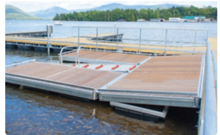
Hinge & connection at top of ramp to our galvanized steel truss floating dock.