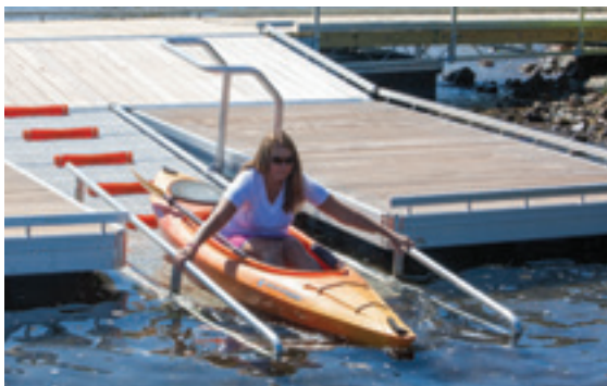
Grab & Launch Rails for a smooth transition