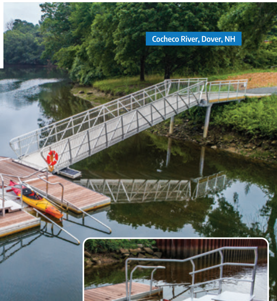
Cocheco River, Dover, NH

Our commercial kayak launch with ADA transfer platform combined with our aluminum frame rowing docks. 38' x 7' aluminum gangway and our pile dock serves as a shore hitch.