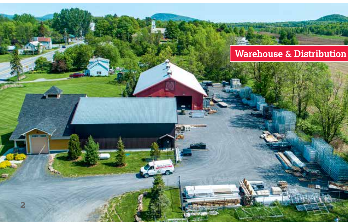
Warehouse & Distribution