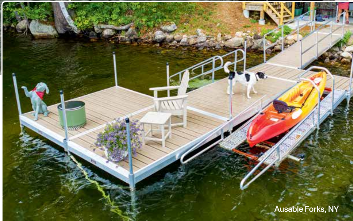
Ausable Forks, NY

Medium duty aluminum leg docks with custom handrails on the 4' x 12' ramp section. Includes our freestanding launch system, shown on pages 60-61.