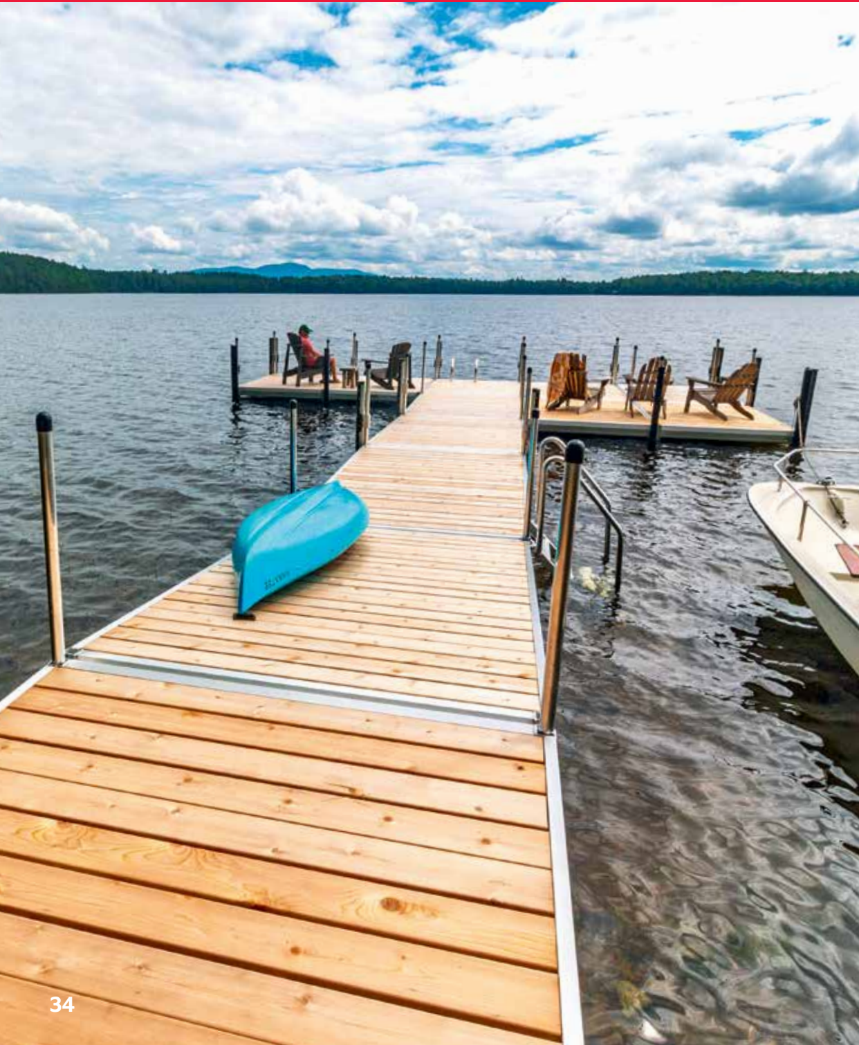
Lower access platform for paddle sports and swimming.