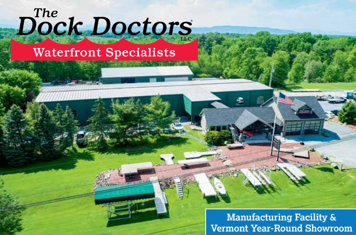
Manufacturing Facility & Vermont Year-Round Showroom