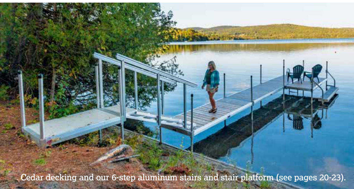
Cedar decking and our 6-step aluminum stairs and stair platform (see pages 20-23).