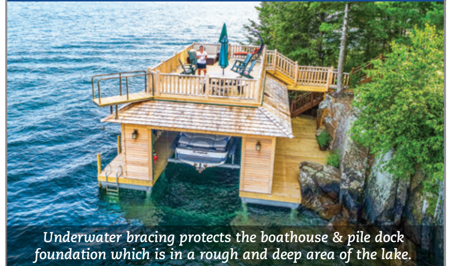
Site with ledge & deep, rough water

Underwater bracing protects the boathouse & pile dock foundation which is in a rough and deep area of the lake.