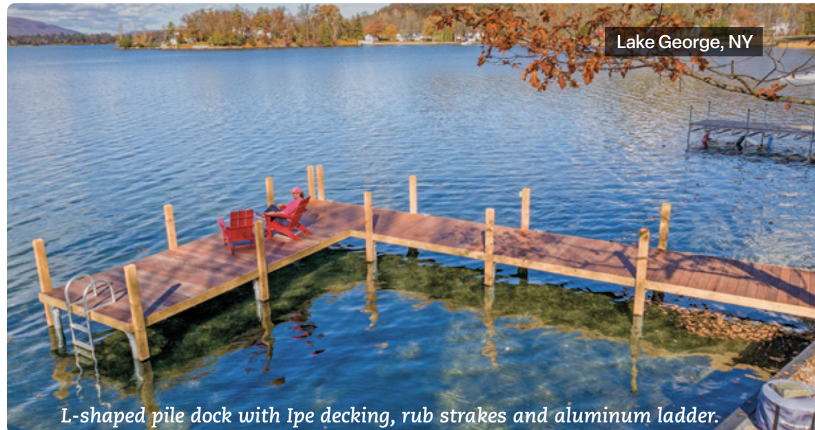
Lake George, NY