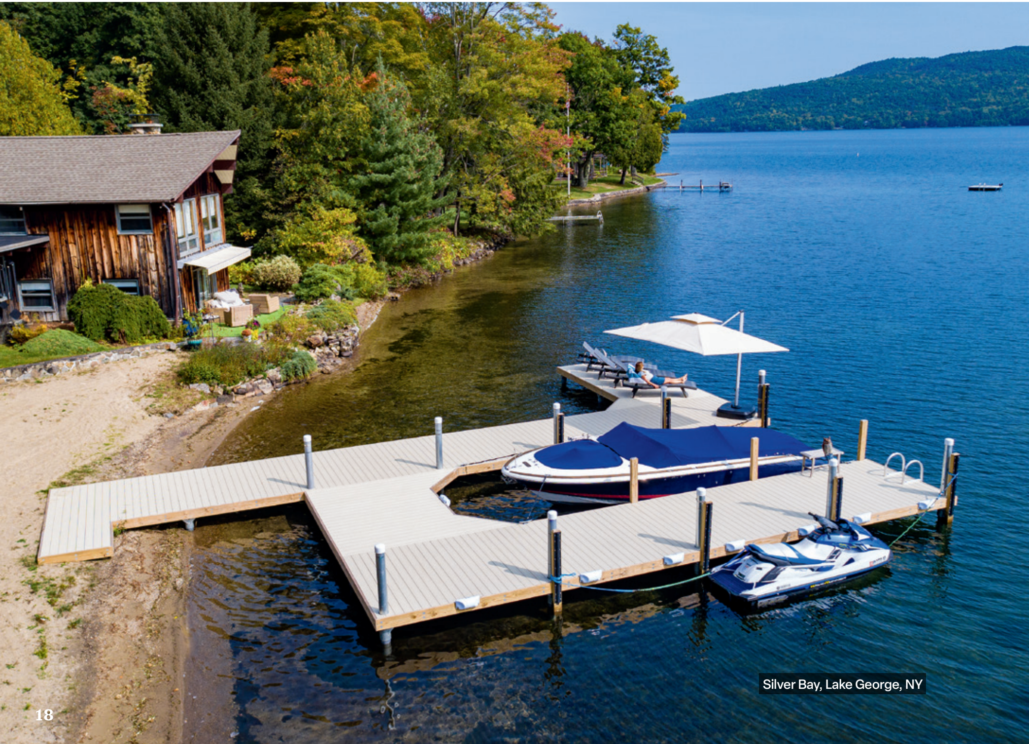
Silver Bay, Lake George, NY