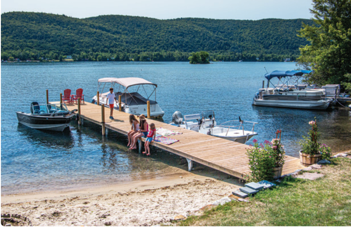
Above: Pile dock with rub strakes and piles cut below the decking.