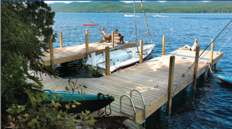
Site with extremely deep & rough water

We specialize in designs for deepwater and difficult sites, as well as non-traditional or specialty designs. Whether your site has a minimal shoreline, rough or deep water, or underwater ledge, we have the equipment, knowledge and experience to build for your site.