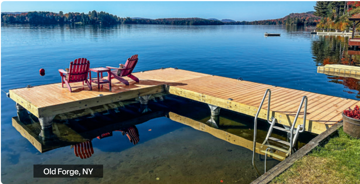
Below: L-shaped pile dock with Weardeck decking and our shallow water stairs.