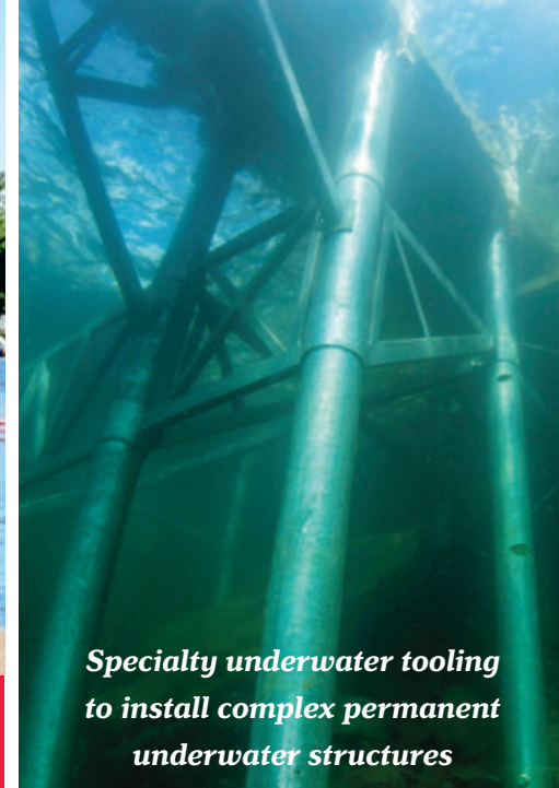
Specialty underwater tooling to install complex permanent underwater structures