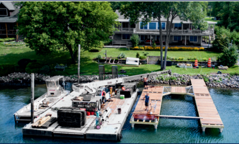
Specialty equipment to reach sites with little to no shoreline