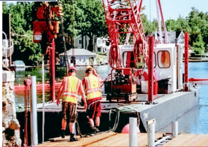
Pile driving from 4" to 12" in diameter (larger if necessary)