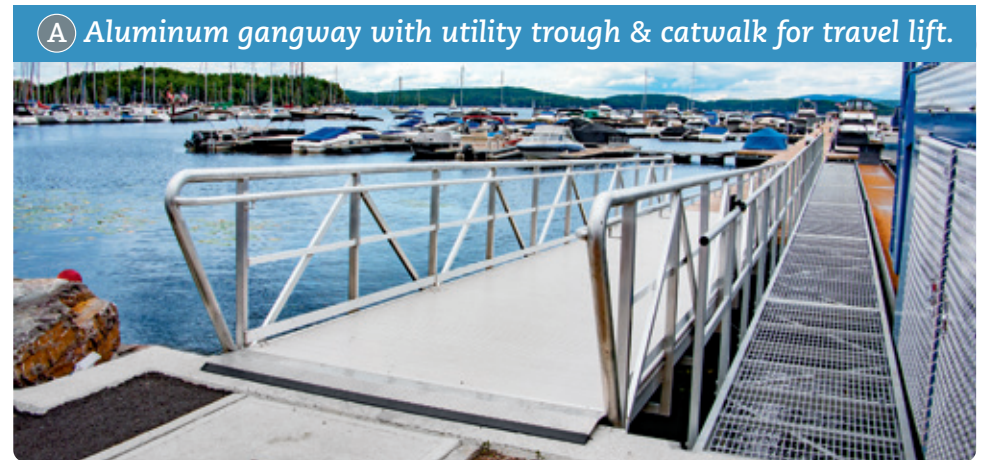
A Aluminum gangway with utility trough & catwalk for travel lift.