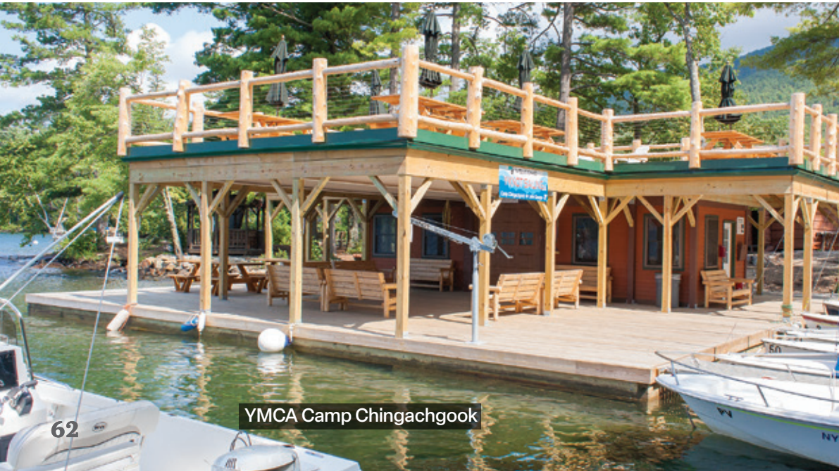
YMCA Camp Chingachgook

Below: New crib dock as a foundation for the boathouse shown left.