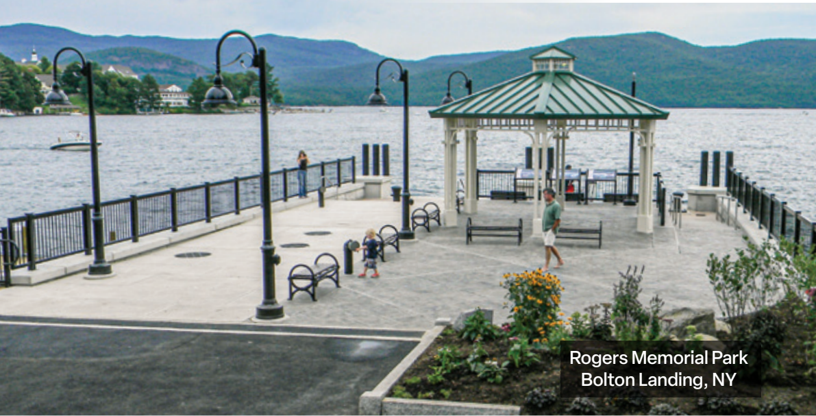
Rogers Memorial Park Bolton Landing, NY

We are experienced with all phases of commercial waterfront construction. We offer on-site consultations and conceptual layouts. We will help you with all aspects of your project from consultation, design & permits, to service and installation. Please contact us today to start planning your project.