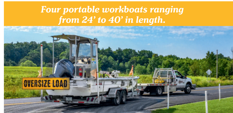
Four portable workboats ranging from 24' to 40' in length.

We have the experienced staff, the necessary equipment and the specialty tooling to offer a full range of services for all of your waterfront needs.