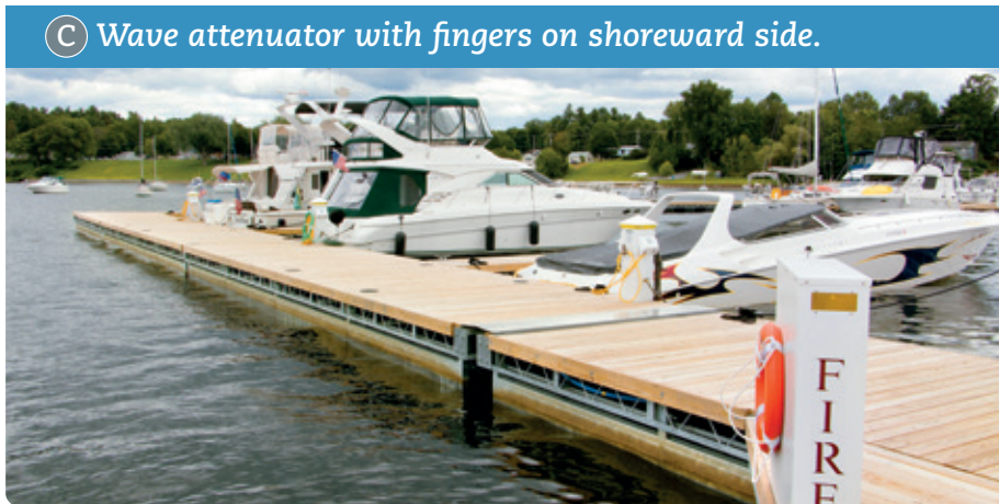
C Wave attenuator with fingers on shoreward side.