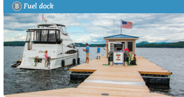
B Fuel dock