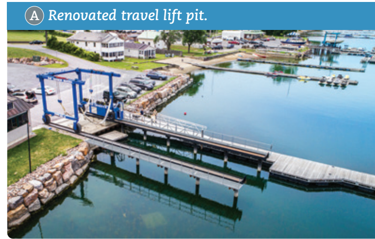
A Renovated travel lift pit.