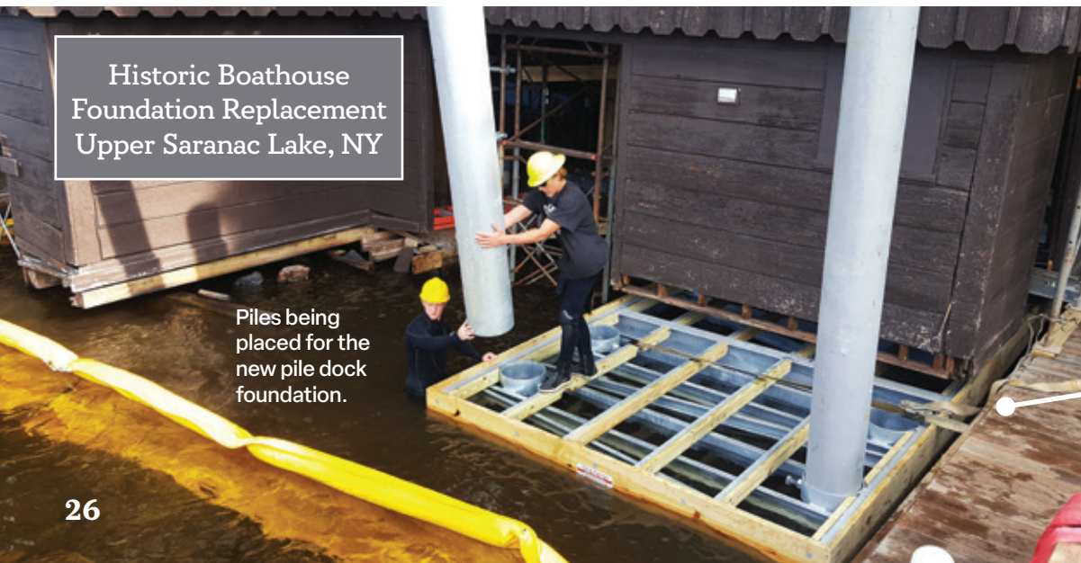
Historic Boathouse Foundation Replacement Upper Saranac Lake, NY