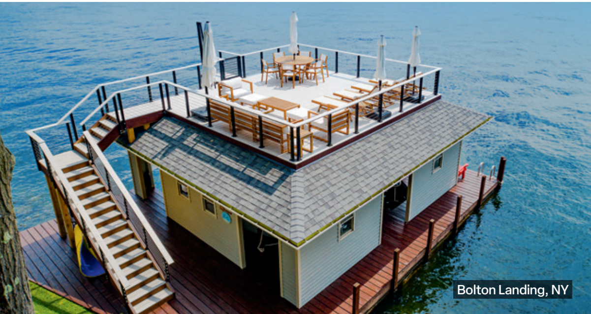
Bolton Landing, NY

We have the experience and necessary equipment to repair or replace your existing Boathouse Foundation, or make upgrades to your existing boathouse. Whether it be a complete replacement with a new pile dock foundation or repairs of an existing crib foundation, we will help with all phases of your project, including the planning, design and permitting.