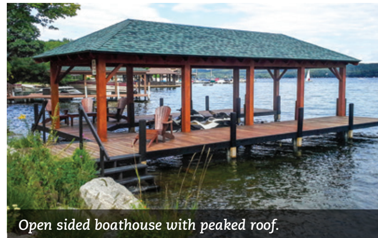
Open sided boathouse with peaked roof.