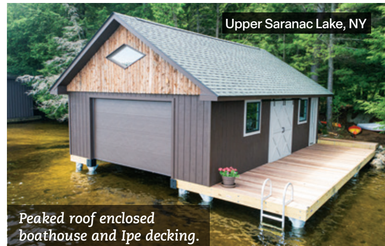
Upper Saranac Lake, NY