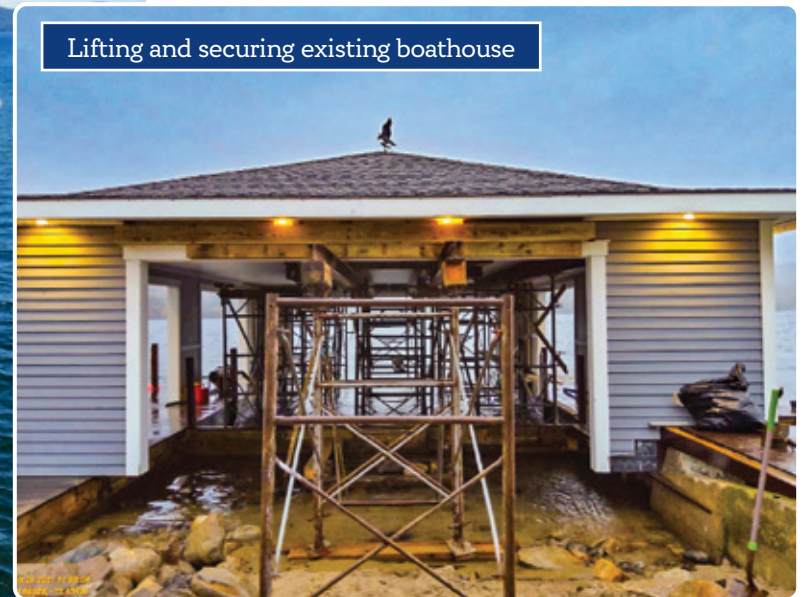
Lifting and securing existing boathouse