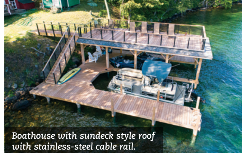
Boathouse with sundeck style roof with stainless-steel cable rail.