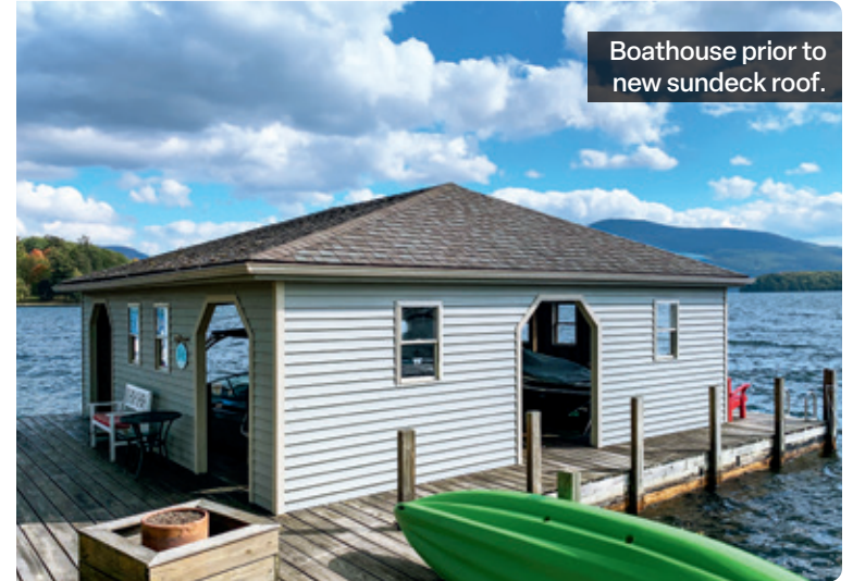
Boathouse prior to new sundeck roof.