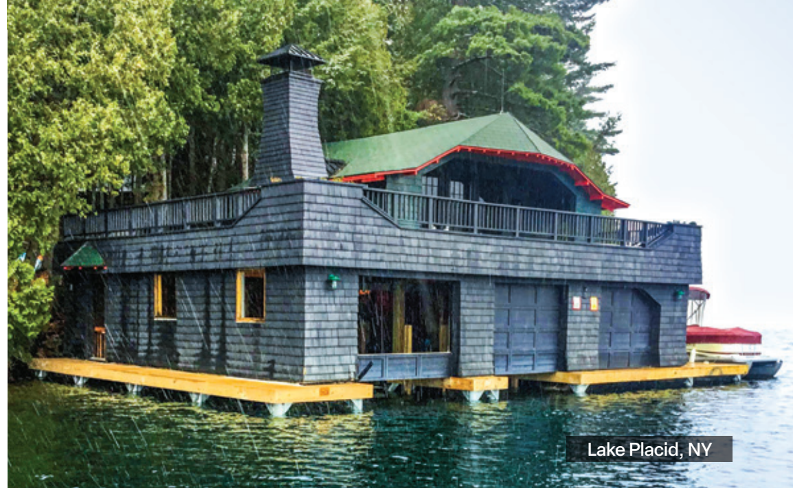
Lake Placid, NY