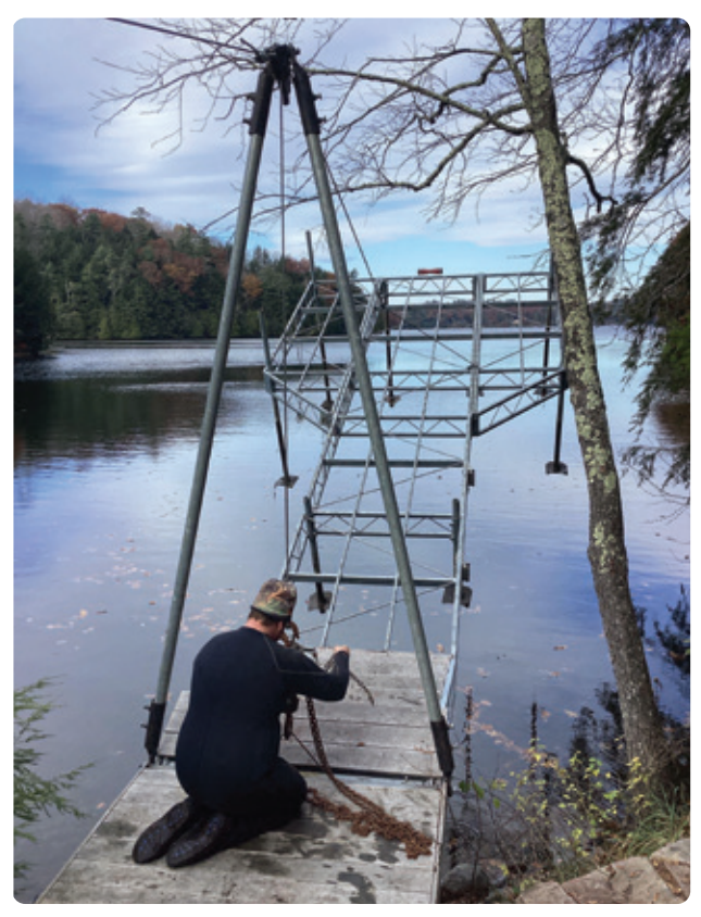
Above: One of our employees raising an articulating dock for winter storage.