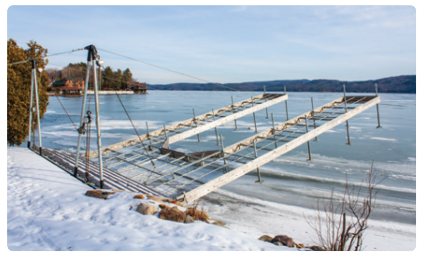
U-shaped articulating dock raised for winter storage.