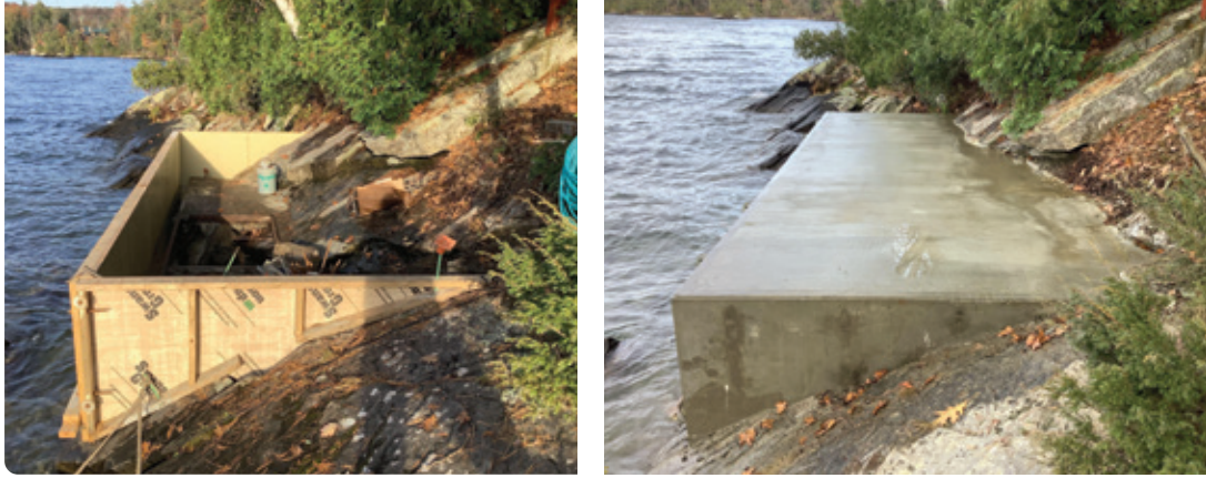
Top: L-shaped articulating dock with a concrete pad as a shore anchor. Above Left: Forms in place for concrete pad. Above Right: Concrete pad completed.