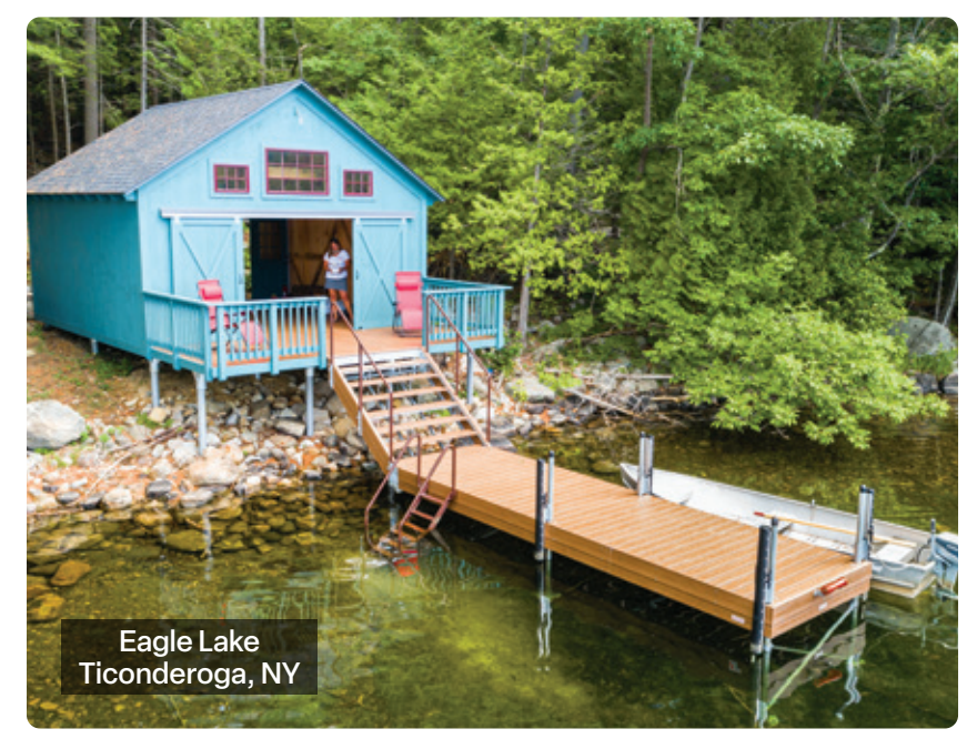
Our pile dock foundation used for articulating dock shore connection & boathouse. Boathouse also designed & constructed by The Dock Doctors.