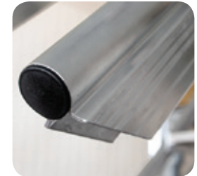
rounded aluminum handrail