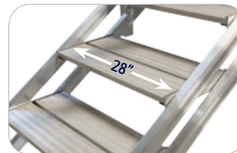
Non-skid, 28" wide stair treads