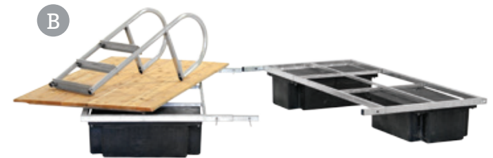
Heavy duty galvanized steel swim float dismantles into two pieces for ease of handling.