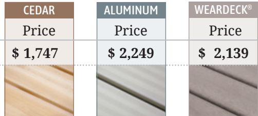
See decking details and color choices on p.13.

*Weight is with decking removed. Custom size swim floats available, please contact us for details. Ipe hardwood or other composite decking options available.