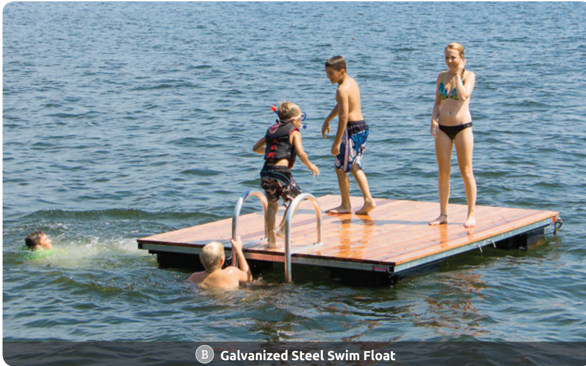
B Galvanized Steel Swim Float