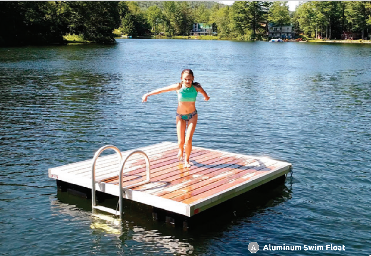
A Aluminum Swim Float