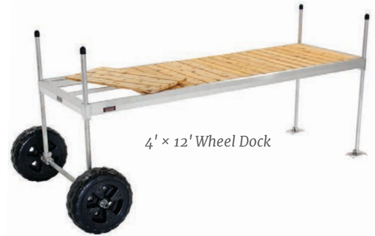
4' x 12' Wheel Dock