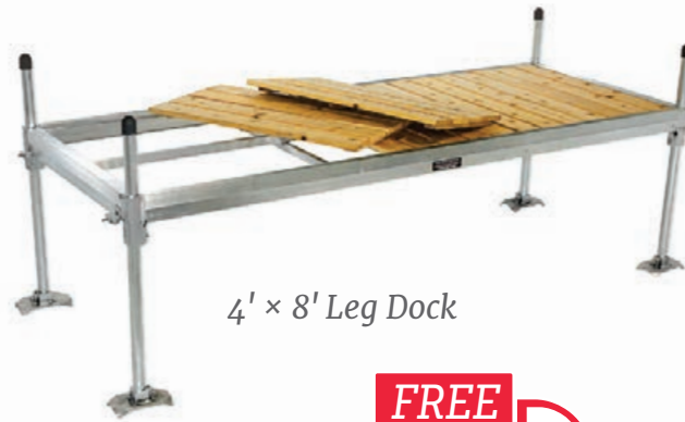
4' x 8' Leg Dock