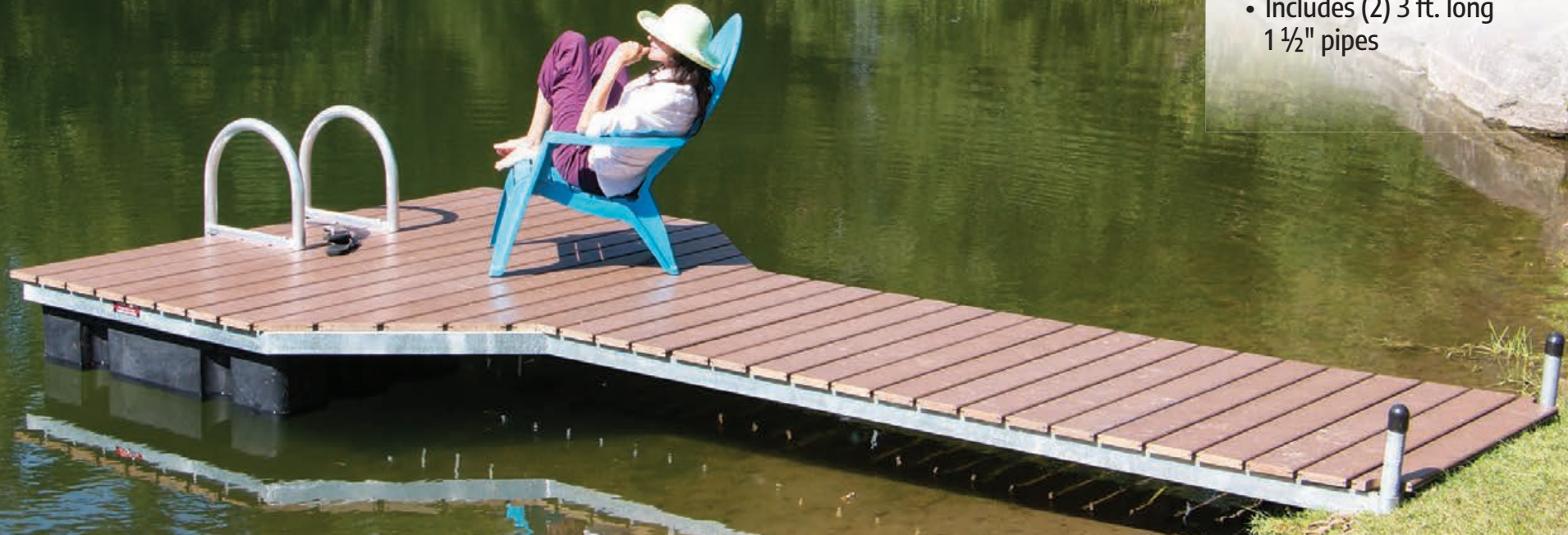
A 4' x 16' Pond Dock galvanized steel frame shown with optional ladder and composite decking