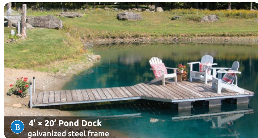
B 4' x 20' Pond Dock galvanized steel frame