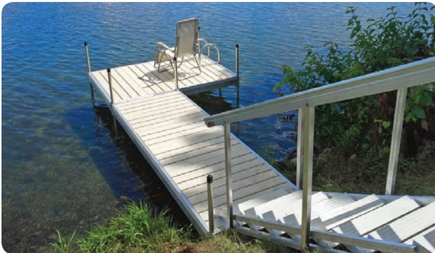
Medium duty aluminum leg docks with aluminum decking. Accessed by our adjustable aluminum stairs (see pages 18-19).