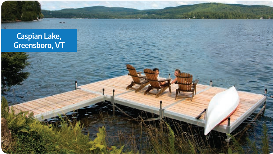
Caspian Lake, Greensboro, VT