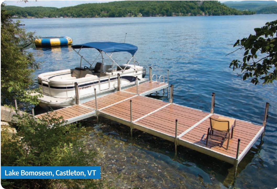
Lake Bomoseen, Castleton, VT