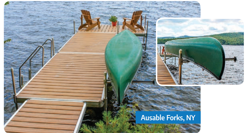
Ausable Forks, NY