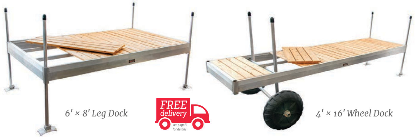
6' x 8' Leg Dock