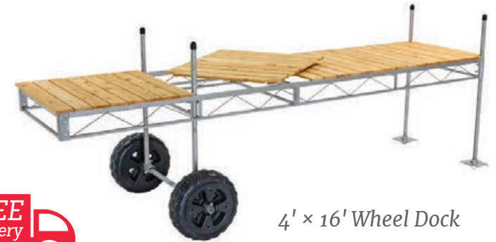
4' x 16' Wheel Dock