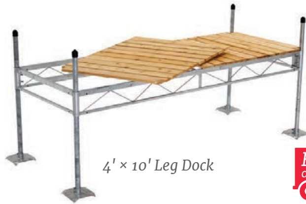
4' x 10' Leg Dock