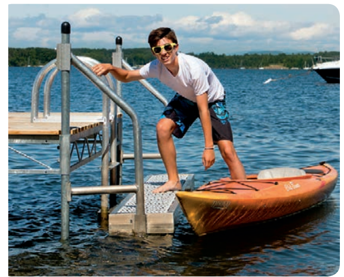
6' wide leg docks with IPE decking upgrade and our lower access platform – for swimming and boarding paddle crafts (see page 9).