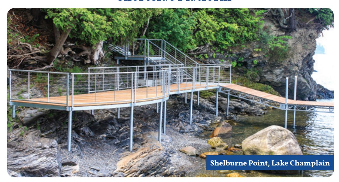
Curved shoreside platform with stainless steel cable rails.