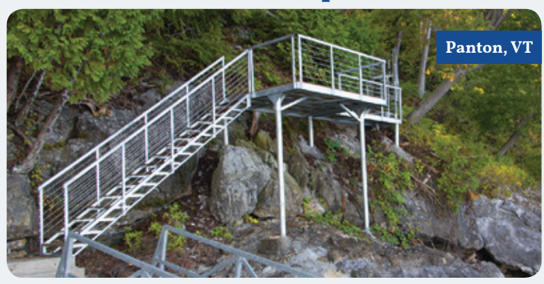
Shore connection system for a custom floating dock