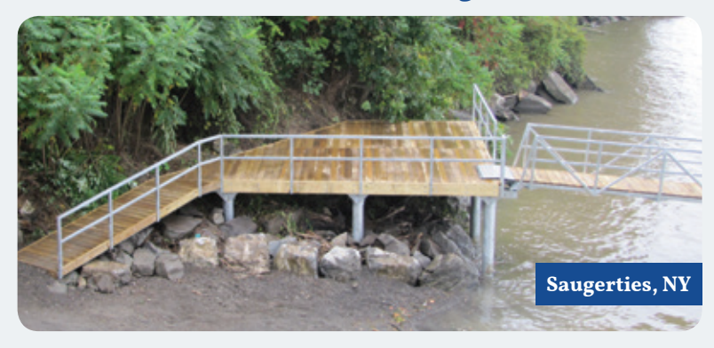
Deck area for a roadside site with no shoreline