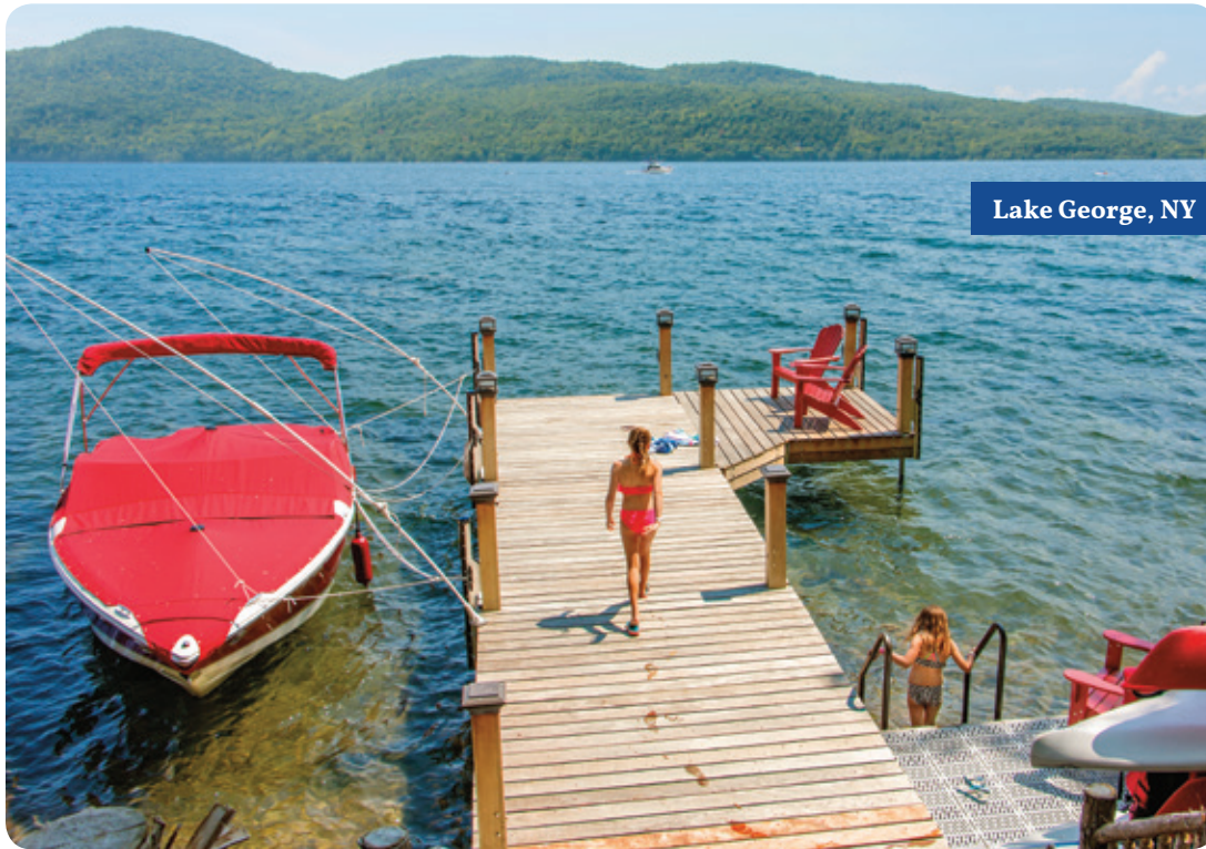
Lake George, NY