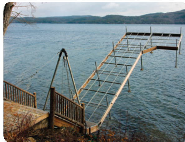
Above dock shown raised for winter.