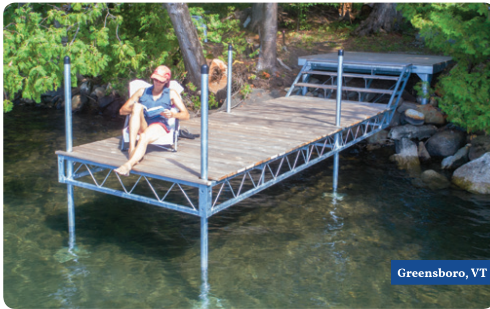
Above: Straight articulating dock with our shoreside platform as a shore mount.