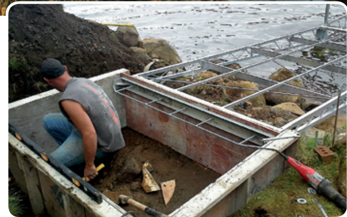
Concrete pad being installed for articulating dock shore connection (above).