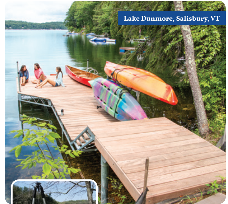
Lake Dunmore, Salisbury, VT