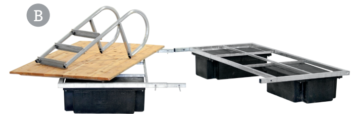
Heavy duty galvanized steel swim float dismantles into two pieces for ease of handling.