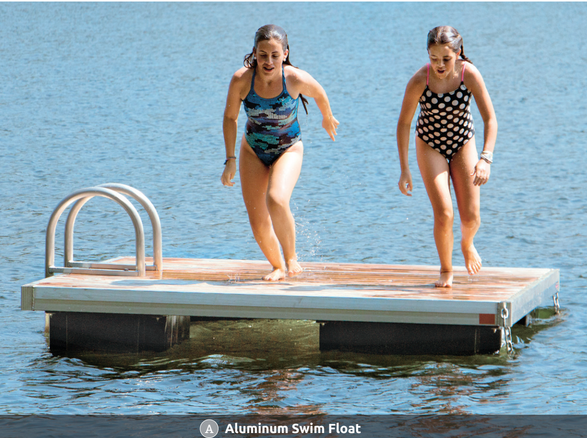
A Aluminum Swim Float