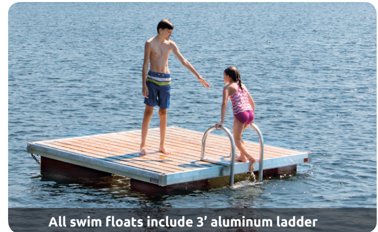
All swim floats include 3' aluminum ladder