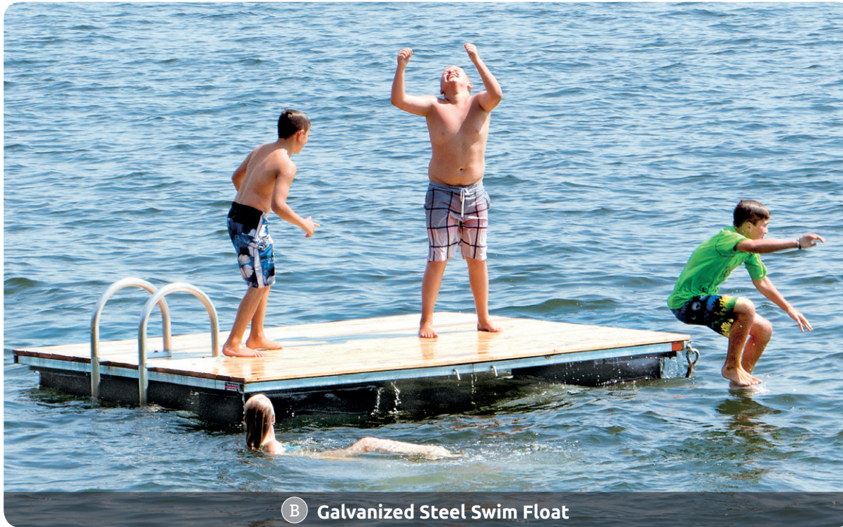
B Galvanized Steel Swim Float