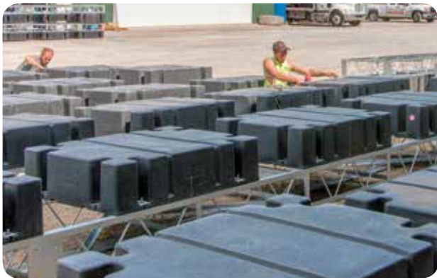
Floats being installed.