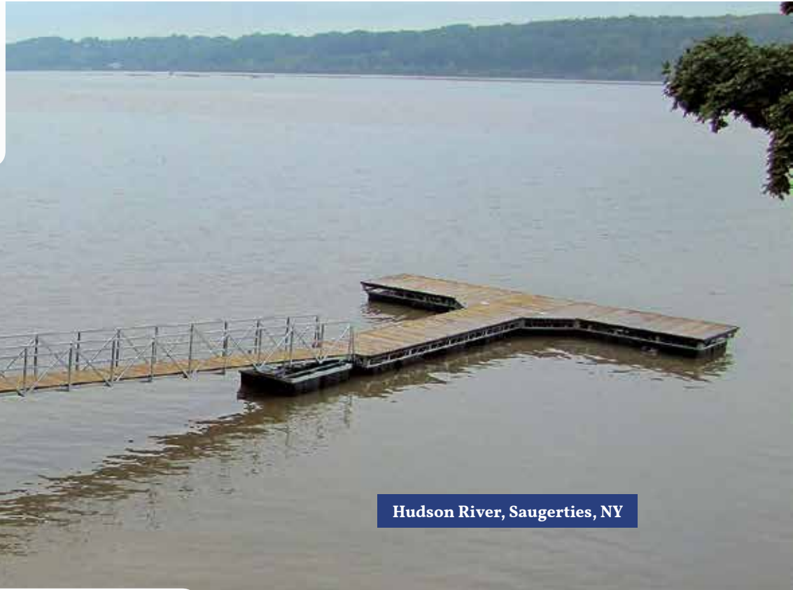
Hudson River, Saugerties, NY

Floating Docks for Tidal Settings – Designed for extreme water fluctuation and heavy wave action often experienced at these sites.