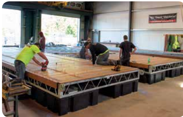
Decking being applied in our workshop.