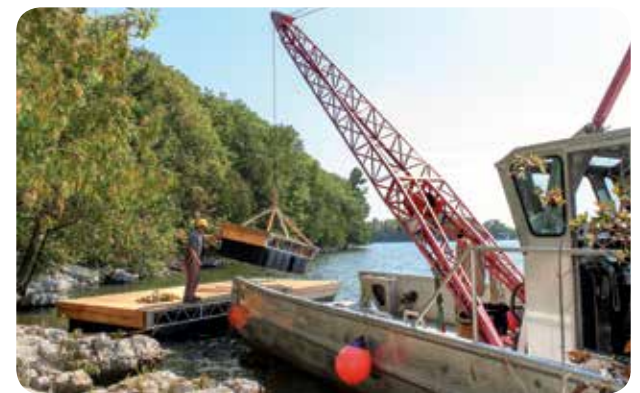
Delivery and installation with our workboat.