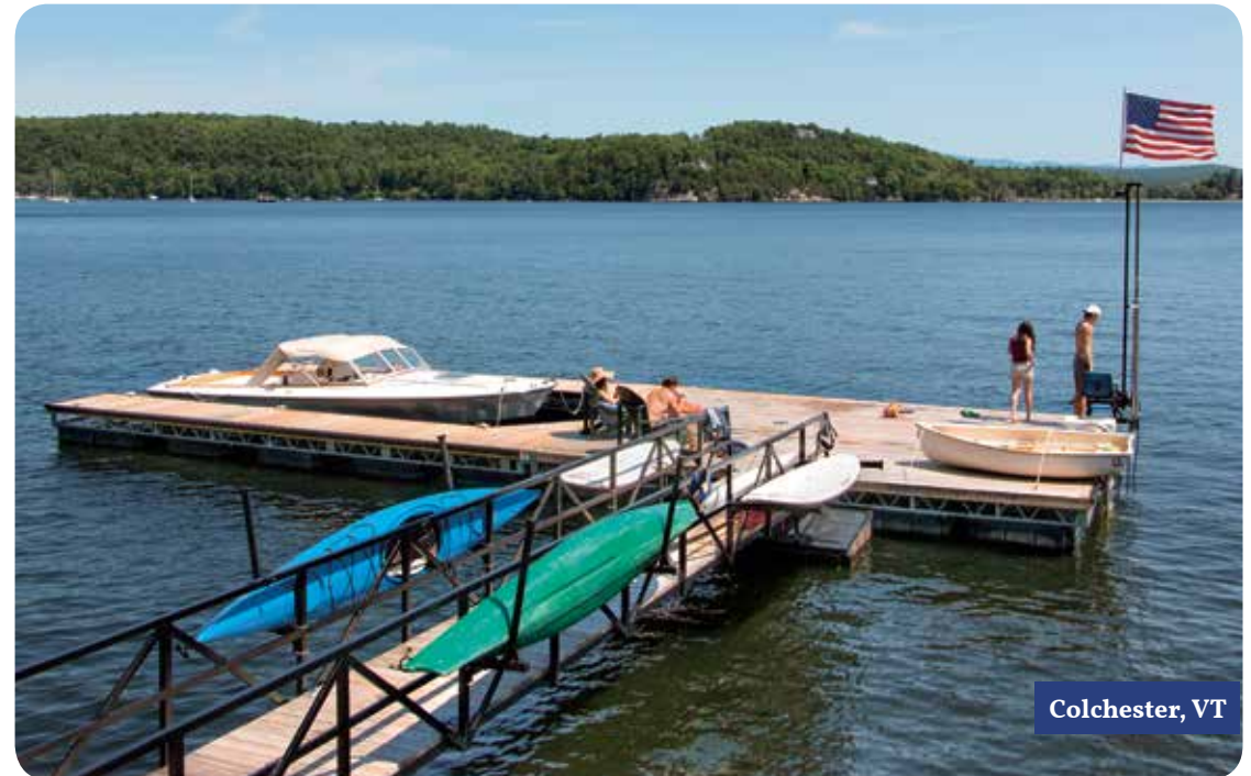
Custom steel truss floating dock installed in a rough area of the lake.