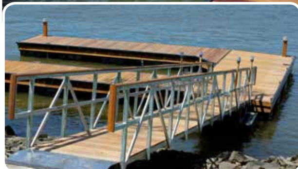
U-shaped heavy duty galvanized steel floating dock with Ipe decking & truss skirting (above & left).