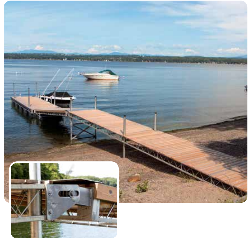
Above: Our mega-duty leg dock used as a transition to a custom heavy duty steel truss floating dock system for a site that has high spring water levels.