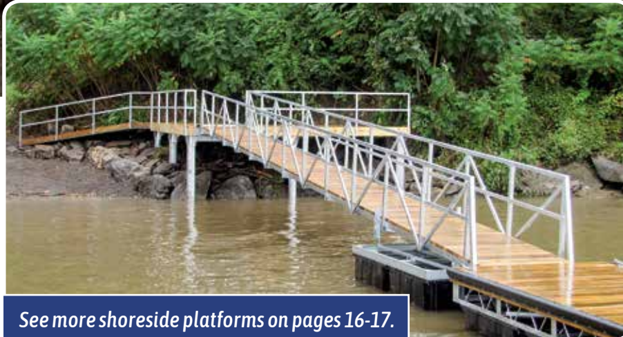
See more shoreside platforms on pages 16-17.