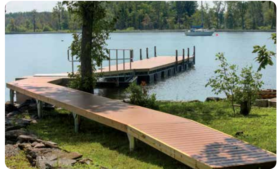
Galvanized steel truss floating dock with vertical fenders & our permanent pile system to allow access when water level is high.