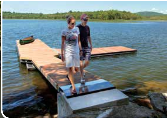
Aluminum tread plate allows for a smooth transition from a typical concrete hitch pad to the dock.