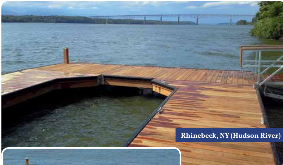
Rhinebeck, NY (Hudson River)