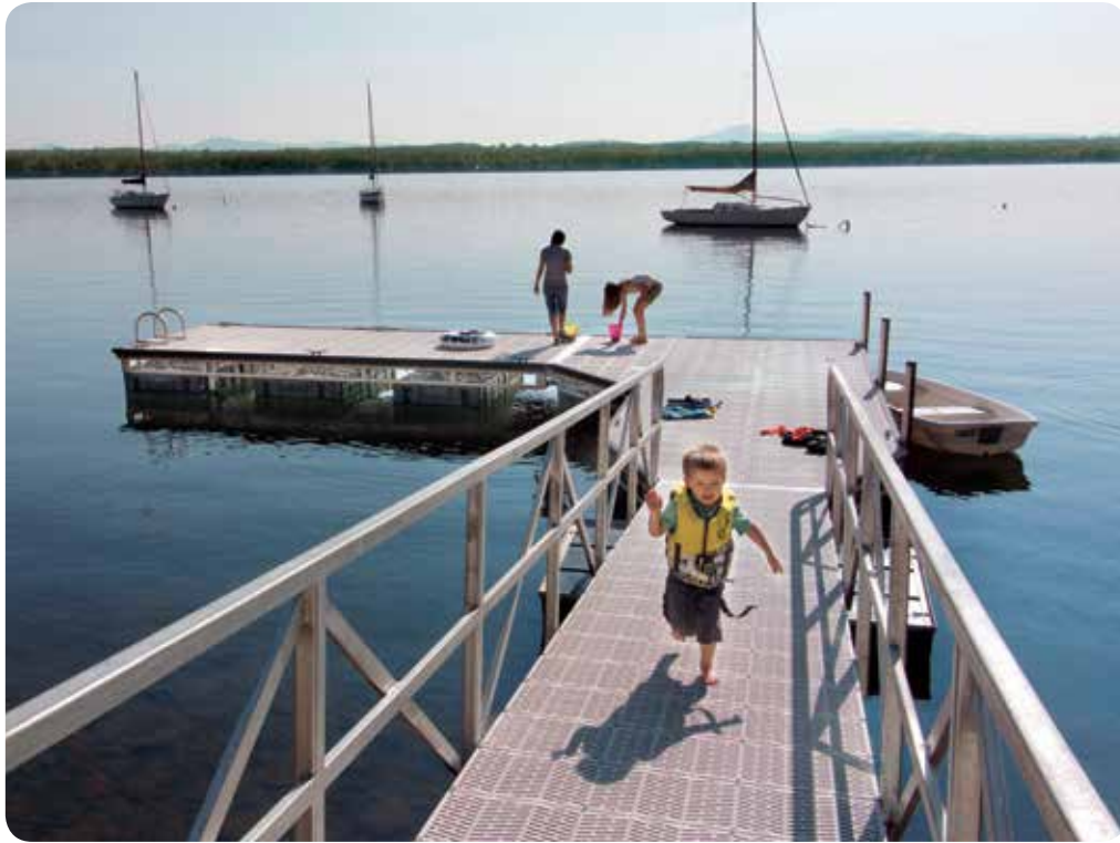
Above: Steel truss floating dock and gangway with Sure-Step® flow-thru decking. Below: Example of a concrete shore-hitch connection.