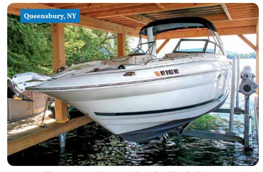
12,000 lb. capacity Ultimate Lift with oil bath drive upgrade.