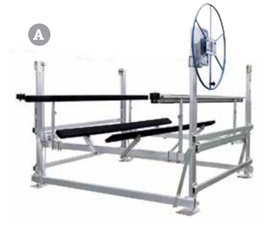
Shown with optional aluminum & carpeted guides & guide rollers