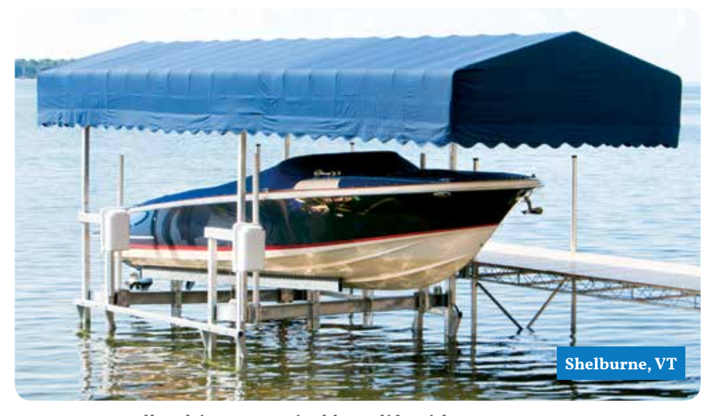
12,000 lb. Ultimate vertical boat lift with custom canopy.