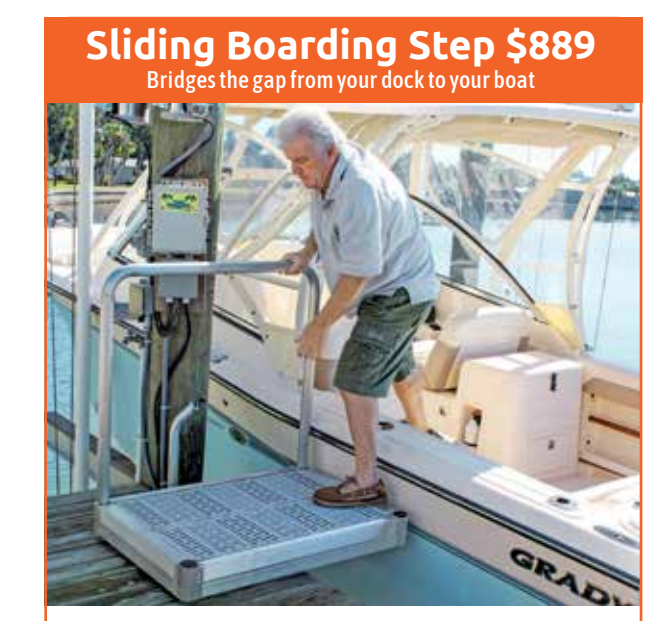
Remove the gap to transition safely to/from your boat. Securely attaches to your existing dock. Find out more at: www.thedockdoctors.com/boardingstep