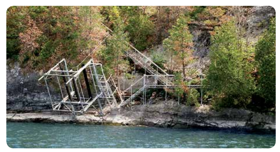
Above: The Dock Doctors Ultimate Lift (see pages 60-63) customized to attach to the shore with galvanized lift arms which allow it to be raised for winter storage.

Occasionally, protecting your boat requires a product that is designed to fit your individual needs. We can design, fabricate, and install custom canopies, boat lifts and much more to accommodate unique situations. Please contact us for a free estimate and conceptual layout.