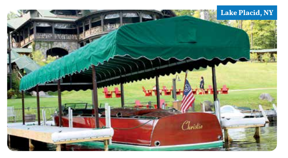
Custom powder coated uprights for use with a standard RGC® canopy.