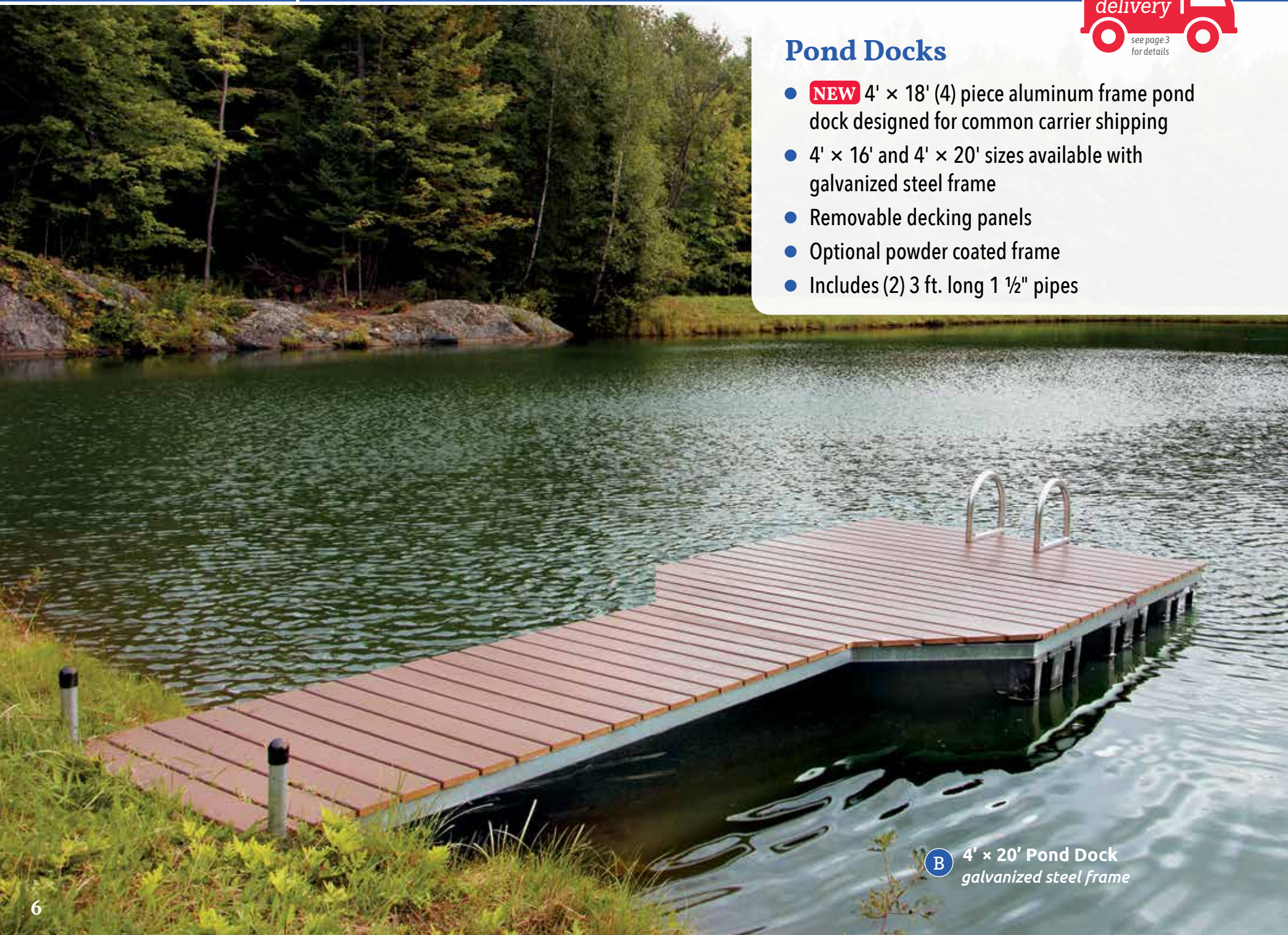
B 4' × 20' Pond Dock galvanized steel frame