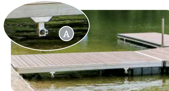
Axle & Wheel mounts for seasonal installation and removal.