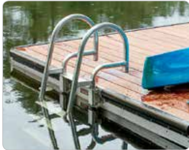
Optional angled ladder