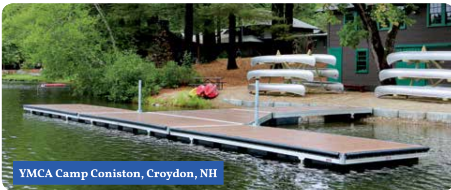
YMCA Camp Coniston, Croydon, NH