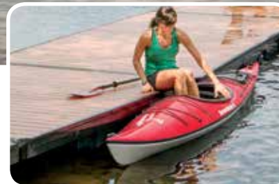
Paddle dock shown with composite decking & powder coated finish.