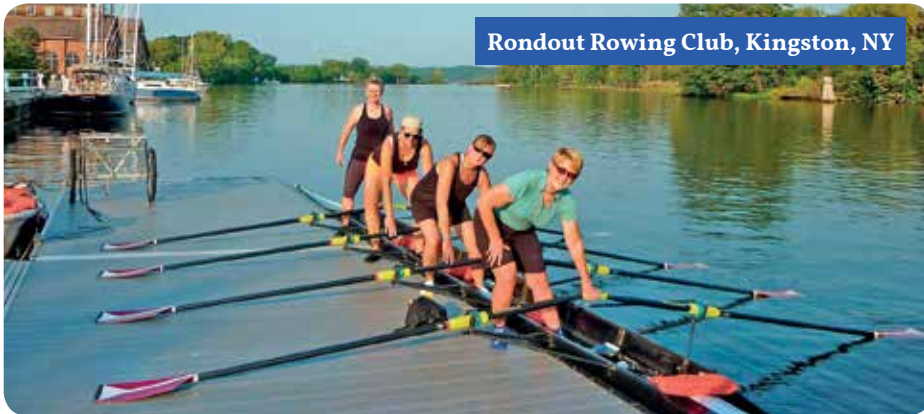
Rondout Rowing Club, Kingston, NY