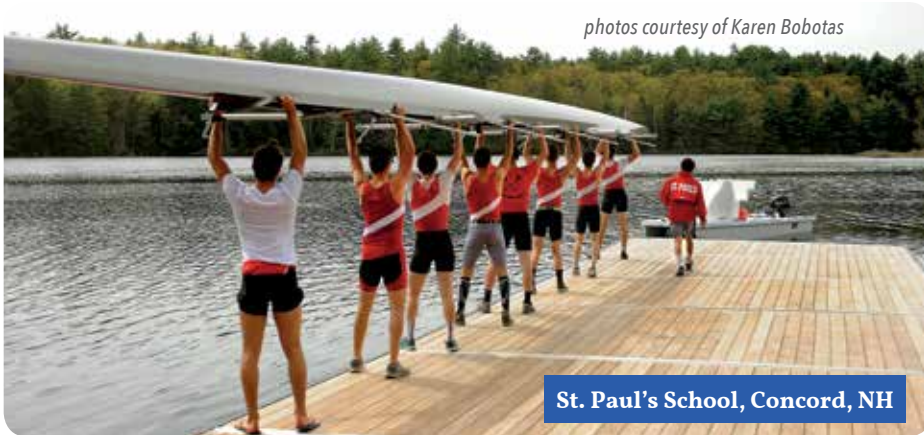
St. Paul's School, Concord, NH