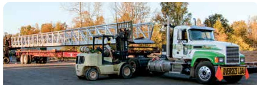
Commercial gangways available with minimal time frames in any length/width