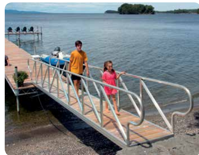
Transitioning to our Mega Duty Leg Dock.