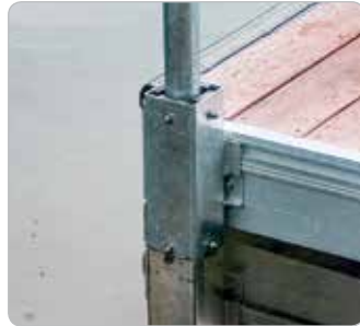
Spud pole anchor example