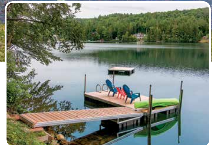
Above: Medium duty aluminum floating docks with cedar decking, vertical fenders, aluminum ladder and anchored with our spud pole anchor mount.