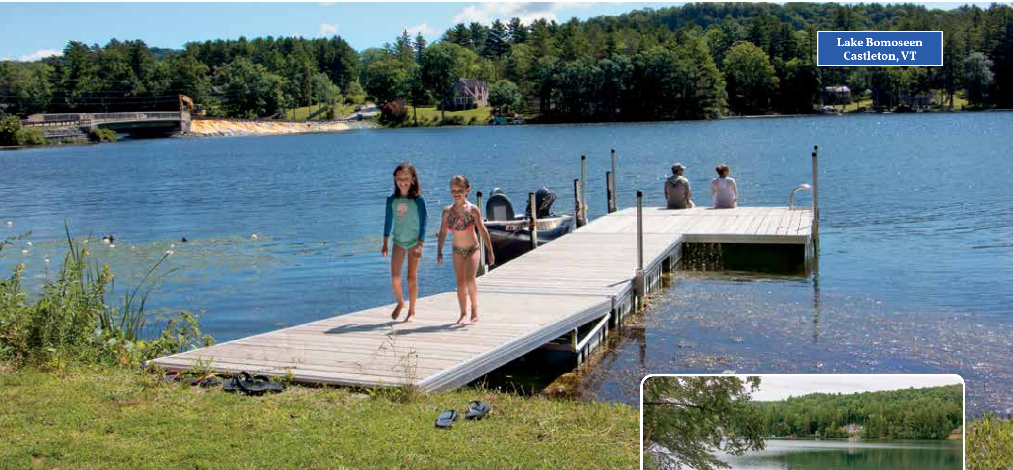
Lake Bomoseen Castleton, VT

Our medium duty aluminum floating docks feature our “aluminum track” frame - allowing for easy mounting of hardware and accessories. These pre-manufactured “stock” docks are readily available for pick up, delivery or installation and are designed to be easily installed for the do-it-yourselfer.