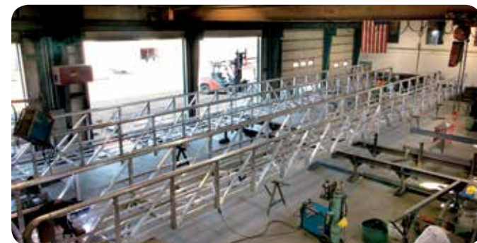
Two (2) 80' gangways during manufacturing.