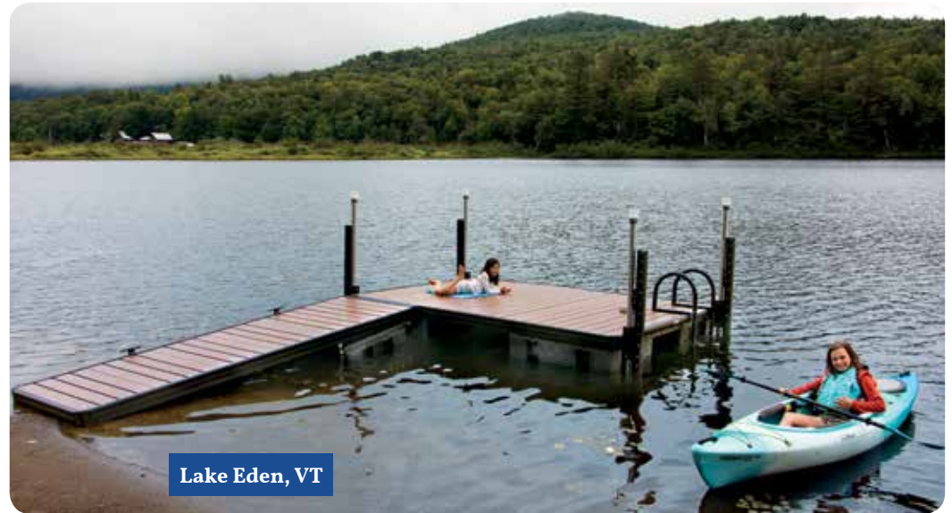
Medium duty aluminum floating docks with optional powder coated frame upgrade and solar post lites (see p. 16).

Our heavy duty aluminum docks are ideal for sites with more exposure (see pages 4-5 & 53-55 in our custom catalog).