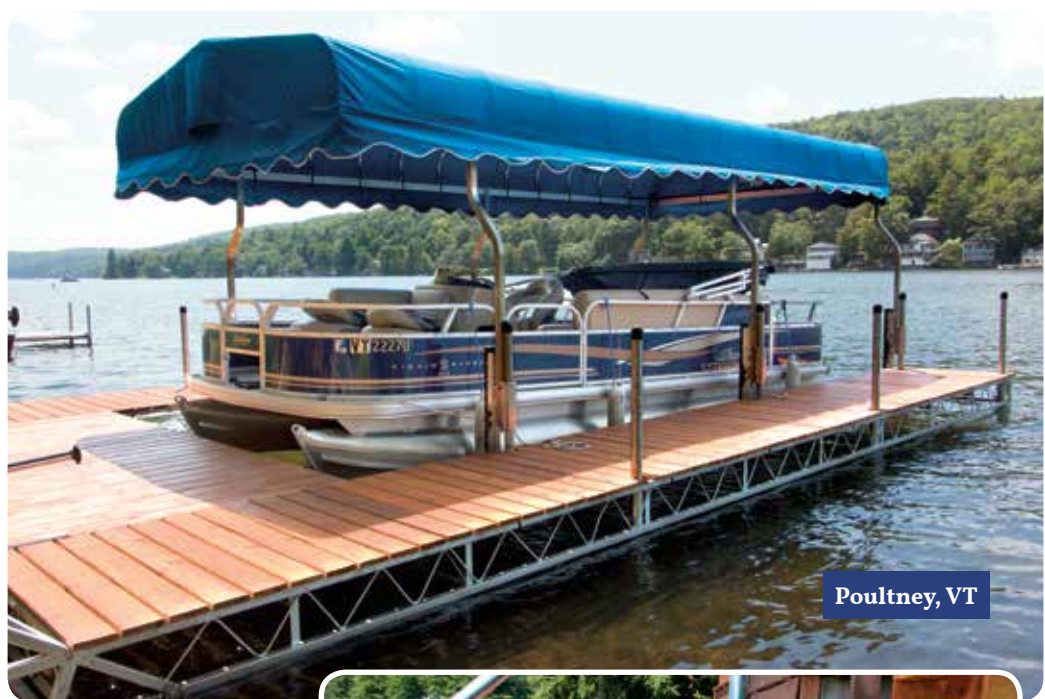
Above: Articulating dock with our shoreside platform as a shore mount (inset).