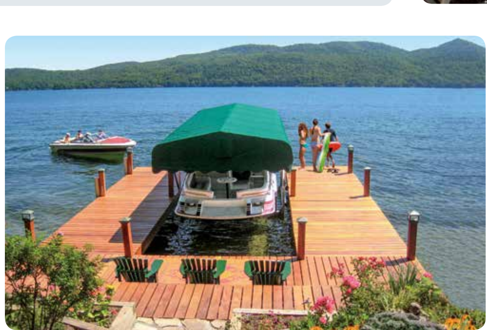
Above: U-shaped articulating dock with post covers.