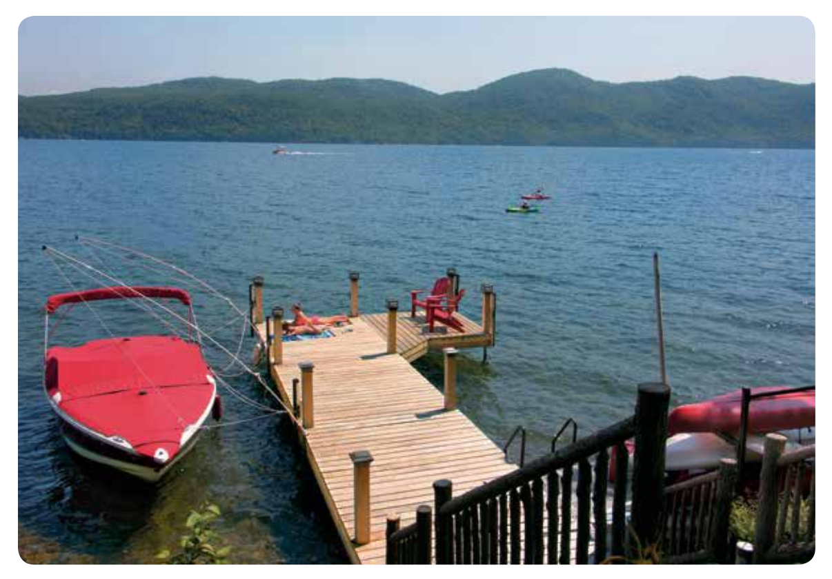
Articulating dock (above) with Ipe decking and custom post covers. Shown raised for winter (below).