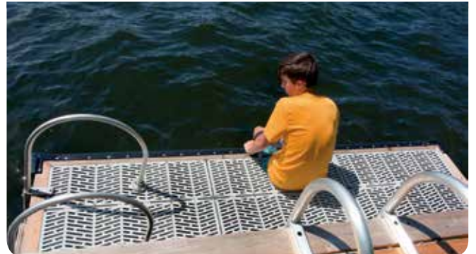
Articulating dock (above top) with lower platform (above bottom) for easy access into kayaks and canoes.