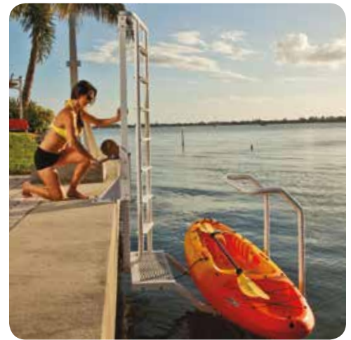
Raise and lower the platform with manual or optional electric winch.