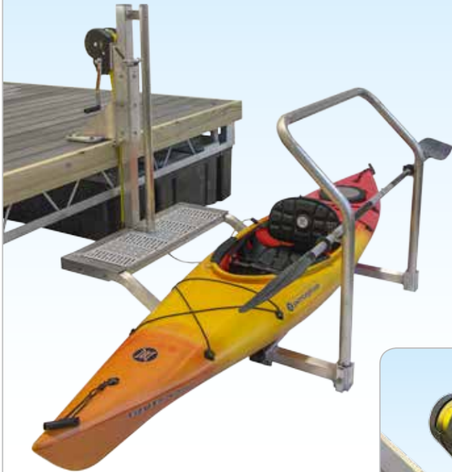
Shown above mounted to a floating dock. Manual winch shown right.