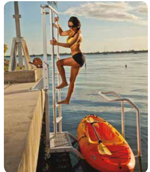
The non-slip treads on the ladder offer safe and easy access.