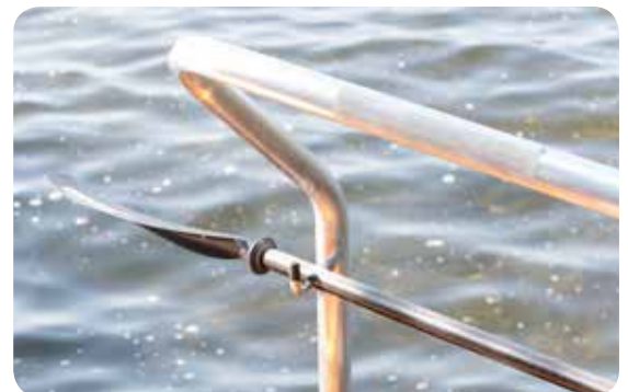
Built-in paddle hooks on boarding handle.

Sure-Step® decking on platform. Adjustable aluminum & vinyl bunks accommodate all kayaks, canoes & paddle boards (not designed for Jet skis).