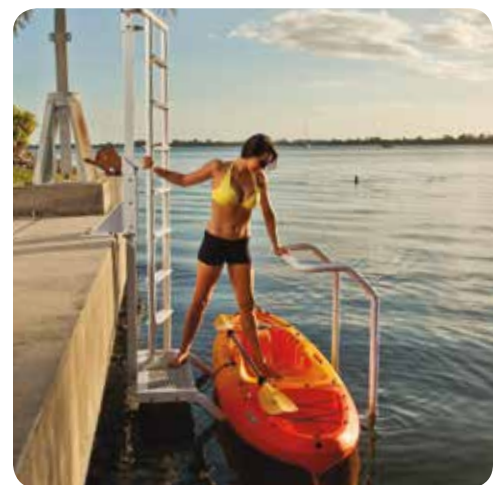
Launch platform features Sure-Step® non-skid decking, boarding handle and kayak leash to secure your craft.