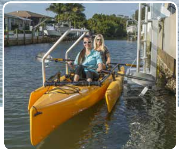
Above: The KLL-400 model accommodates larger crafts such as the Hobie Mirage® Tandem shown above.