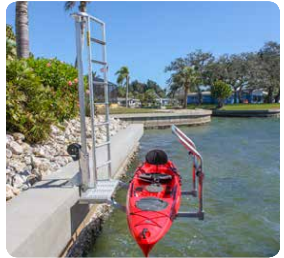
Model KLL-100 mounted to a seawall.