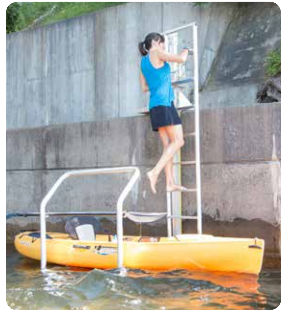
6 feet of vertical lifting range.