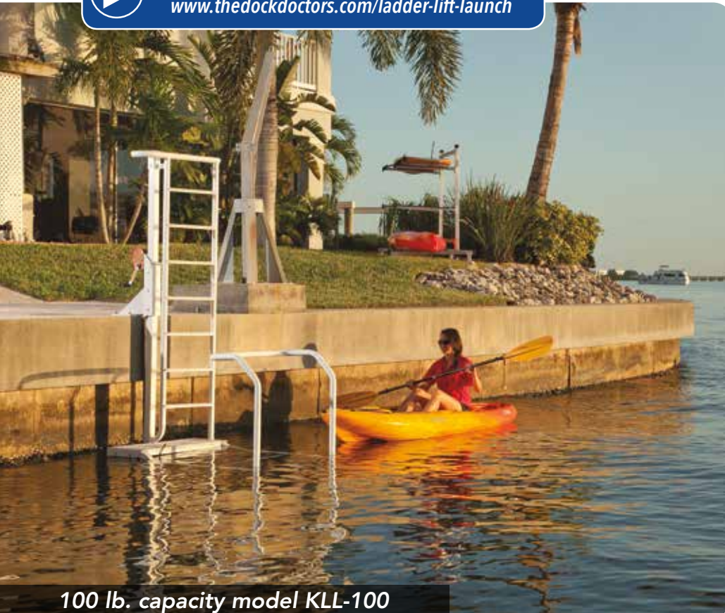
100 lb. capacity model KLL-100

Watch a video of the kayak ladder lift at: www.thedockdoctors.com/ladder-lift-launch