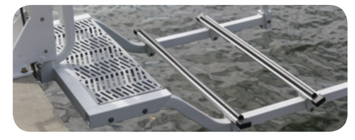
Below: KLL-100 model shown with optional powder coated finish.

Below: Sure-Step® decking on platform. Adjustable aluminum & vinyl bunks accommodate all kayaks, canoes & paddle boards (not designed for Jet skis).