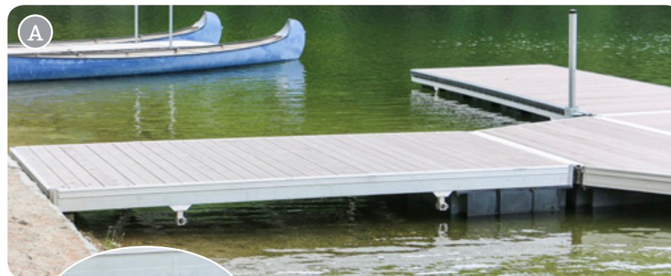
Axle & Wheel mounts for seasonal installation and removal.