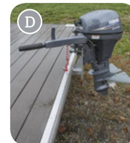
Move your rowing dock with ease by land or water with our optional wheel and tongue assembly or motor mount.