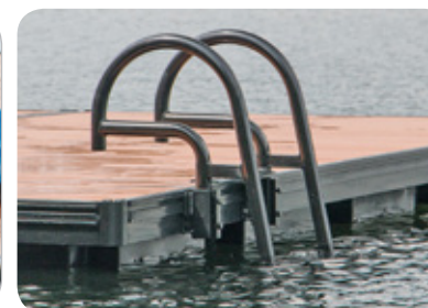
Angled ladder - available in marine-grade aluminum or powder coated finish.