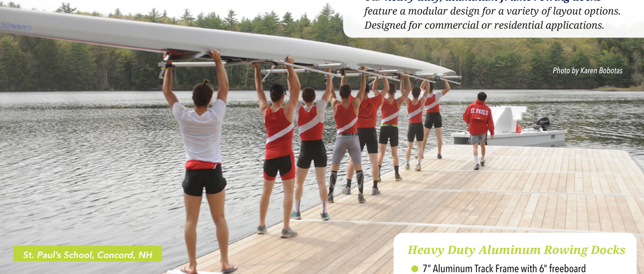
St. Paul's School, Concord, NH