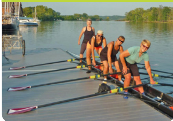
Rondout Rowing Club, Kingston, NY