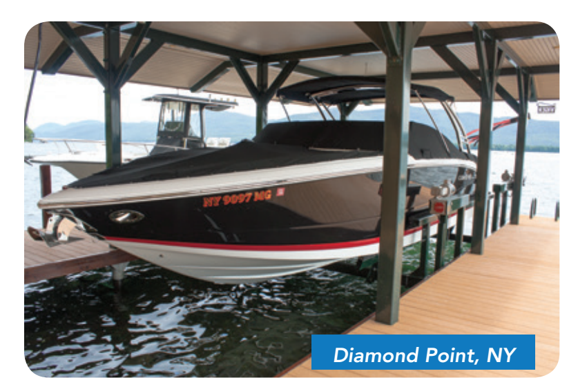
12,000 lb. capacity Ultimate vertical boat lift with optional powder coating.