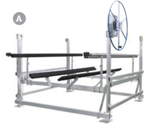
Shown with optional aluminum & carpeted guides & guide rollers