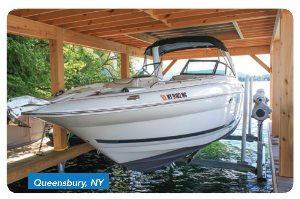
12,000 lb. capacity Ultimate Lift with oil bath drive upgrade.