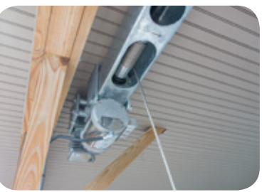
Sling style boathouse lifts are ideal for shallow water applications.

Occasionally, protecting your boat requires a product that is designed to fit your individual needs. We can design, fabricate, and install custom canopies, boat lifts and much more to accommodate unique situations. Please contact us for a free quote and conceptual layout.