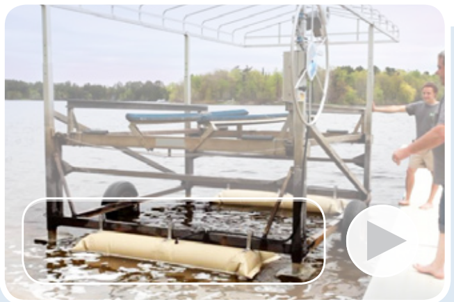
Watch a video on our website at: www.thedockdoctors.com/boatlift-removal

Prices include aluminum canopy frame & fabric in standard colors ( Pacific Blue, Cadet Grey & Forest Green ). Signature colors available as a special order at an additional cost. Additional costs for shipping may apply for canopies not in stock.