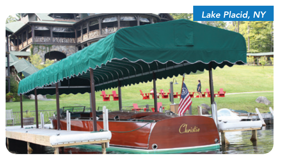
Custom powder coated uprights for use with a standard RGC® canopy.