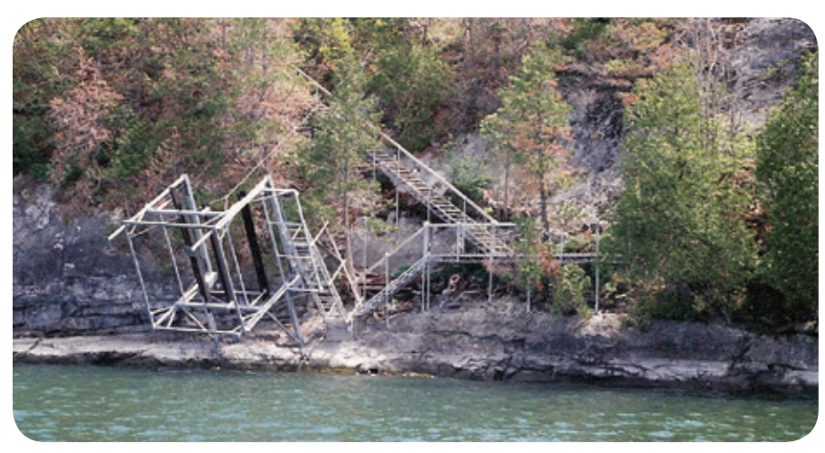
Above: The Dock Doctors Ultimate Lift (see pages 60-63) customized to attach to the shore with galvanized lift arms which allow it to be raised for winter storage.

Occasionally, protecting your boat requires a product that is designed to fit your individual needs. We can design, fabricate, and install custom canopies, boat lifts and much more to accommodate unique situations. Please contact us for a free quote and conceptual layout.