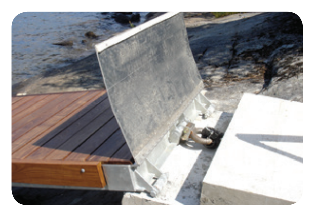
Concrete hitch pad with pintle hitch - aluminum tread plate in raised position.