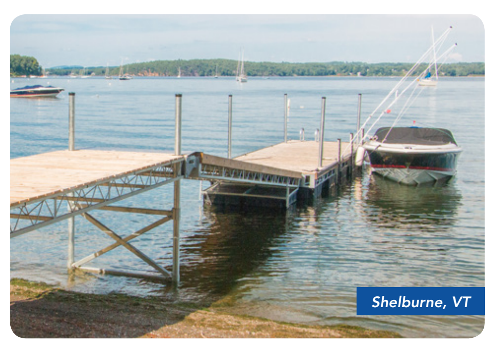
Our mega duty leg dock used as a transition to a custom heavy duty steel truss floating dock system.