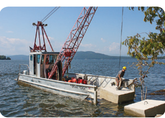
Our work boat "Miss Doc" setting anchors for a floating dock system.