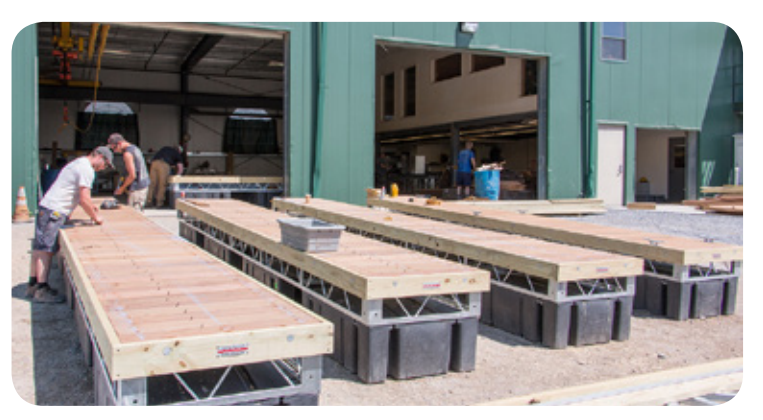
Decking being applied in our workshop.