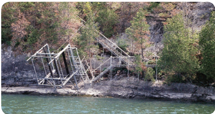
Above: The Dock Doctors Ultimate Lift (see pages 60-63) customized to attach to the shore with galvanized lift arms which allow it to be raised for winter storage.

Occasionally, protecting your boat requires a product that is designed to fit your individual needs. We can design, fabricate, and install custom canopies, boat lifts and much more to accommodate unique situations. Please contact us for a free quote and conceptual layout.