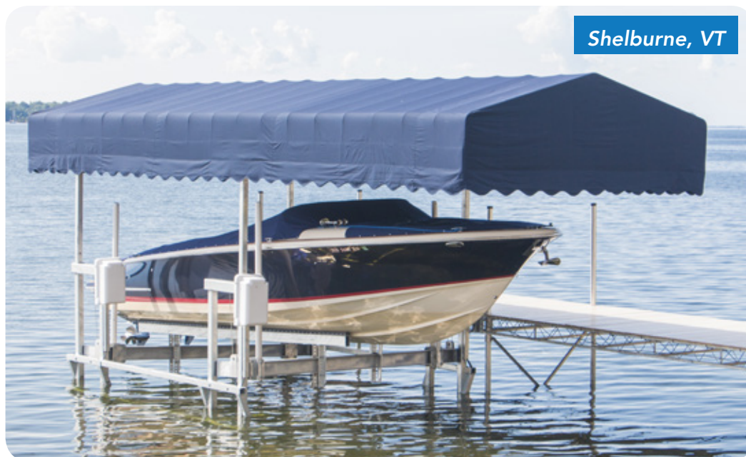
12,000 lb. Ultimate vertical boat lift with custom canopy.