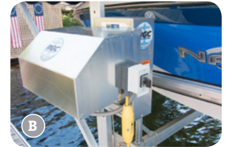
R18LT Winch with RGC VL Direct Drive