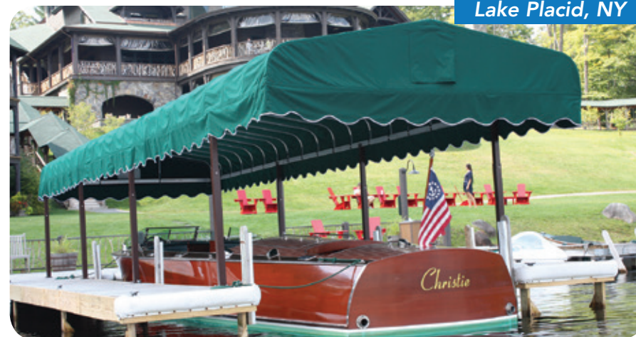
Custom powder coated uprights for use with a standard RGC® canopy.