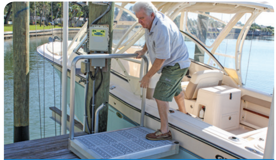
Sliding Boarding Step: Bridges the gap from your dock to your boat

12,000 lb. capacity Ultimate Lift with oil bath drive upgrade.