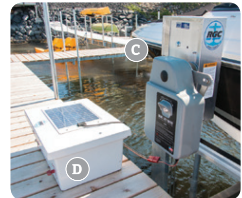
R18LT Winch with (C) Remote Control Extreme Max Power Drive and (D) VL Solar Power Box