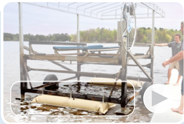
Watch a video on our website at: www.thedockdoctors.com/boatlift-removal

Prices include aluminum canopy frame & fabric in standard colors (Pacific Blue, Cadet Grey & Forest Green). Signature colors available as a special order at an additional cost. Additional costs for shipping may apply for canopies not in stock.