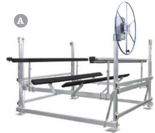
Shown with optional aluminum & carpeted guides & guide rollers