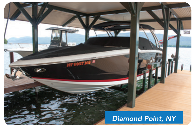
12,000 lb. capacity Ultimate vertical boat lift with optional powder coating.