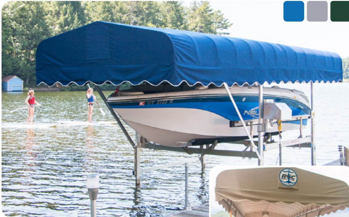
Above: "Pacific Blue" canopy. Right: Optional "Khaki" colored canvas.