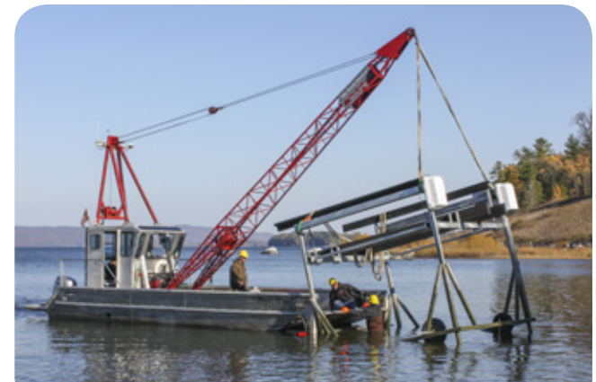
We can deliver and install your boat lift.

*Prices above include Gem remote control, sealed bearing and grooved cable winders, AC drives, (4) 7' vertical guide poles with PVC sleeves, (4) wheel mounts, (4) 24" adjustable legs and heavy duty carpeted bunks. Optional oil bath drives and full length guide-ons are available. Please inquire for pricing.