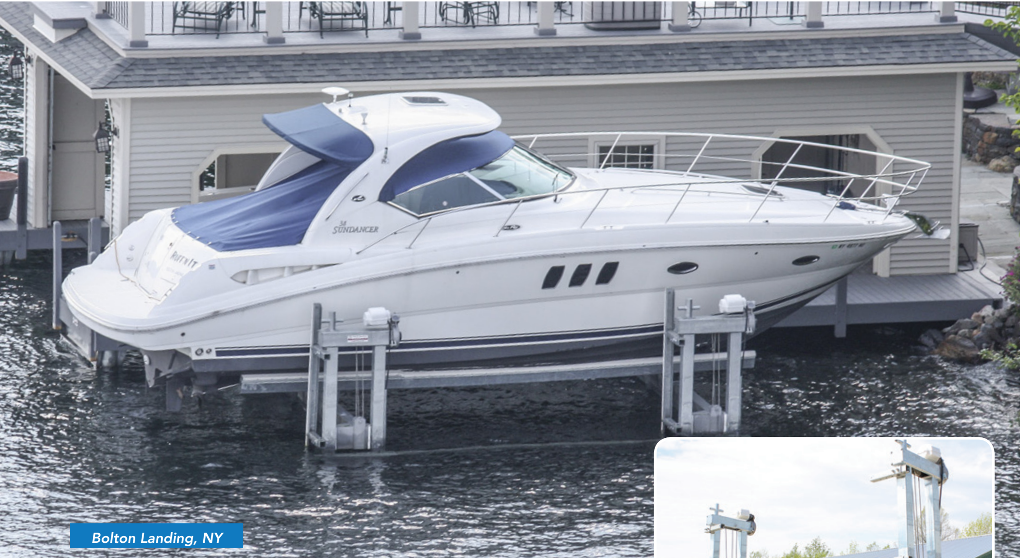
Bolton Landing, NY