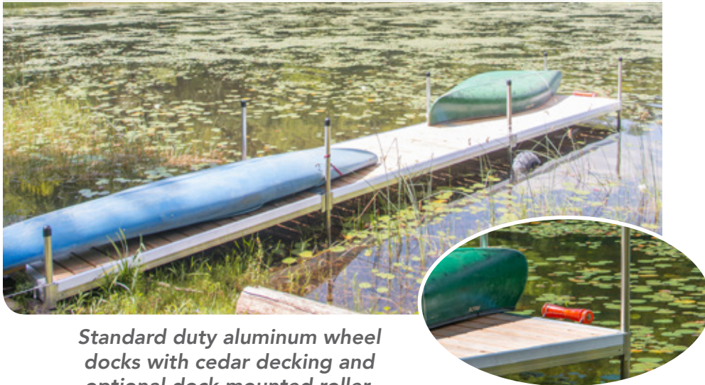
Standard duty aluminum wheel docks with cedar decking and optional dock mounted roller.

Wheel docks easily roll in and out as the water fluctuates during the season.