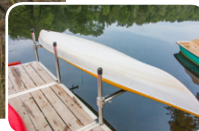
Single craft storage arms (see page 13)