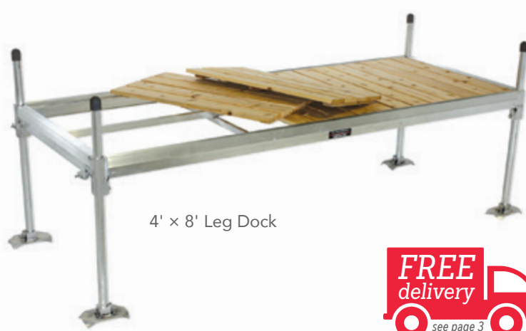
4' x 8' Leg Dock