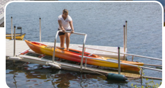
Standard duty aluminum leg dock with Sure-Step® decking and our freestanding launch port system (see page 49).