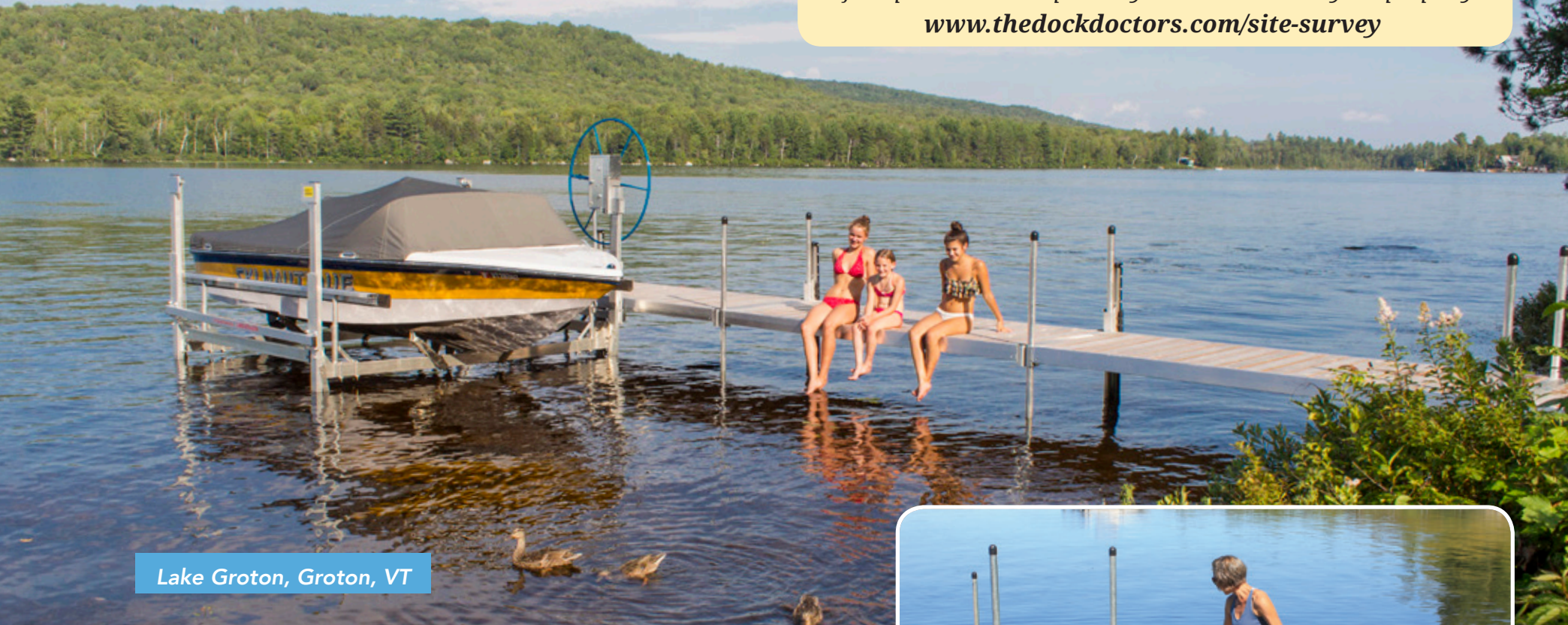
Lake Groton, Groton, VT

Complete our site survey on our website and we will send you a free quote and conceptual layout customized to your property. www.thedockdoctors.com/site-survey