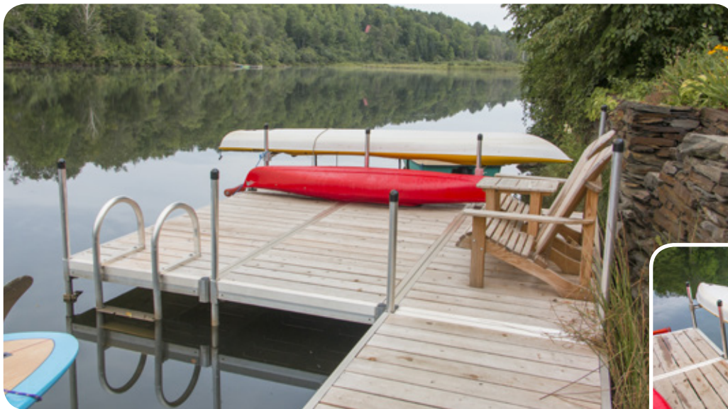
Standard duty aluminum docks used to create a shoreside deck area.