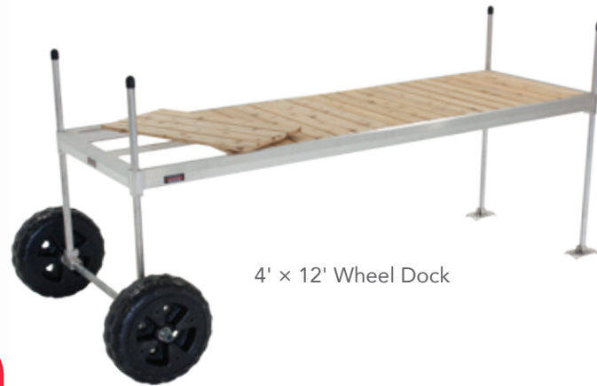
4' x 12' Wheel Dock