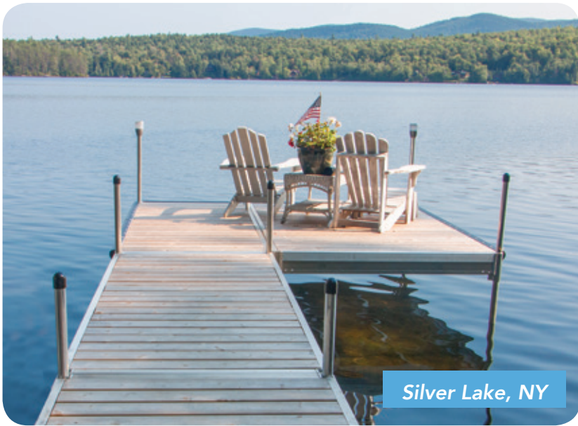
Silver Lake, NY