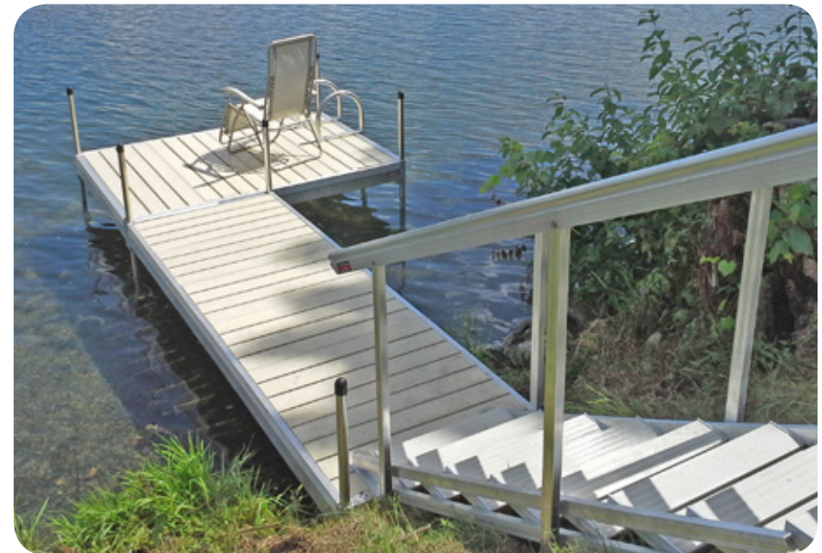
Medium duty aluminum leg docks with aluminum decking. Accessed by our adjustable aluminum stairs (see pages 42-43).