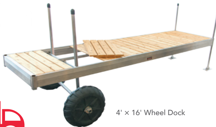
4' x 16' Wheel Dock