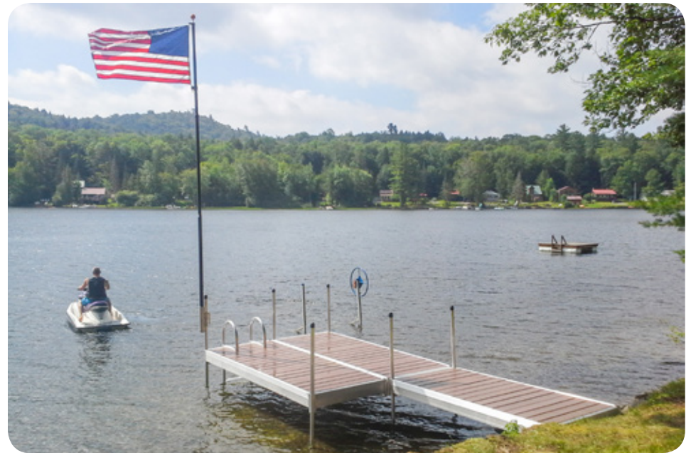
Medium duty aluminum leg docks with cedar decking, aluminum ladder (see page 8) and pipe-mounted flagpole (see page 14).