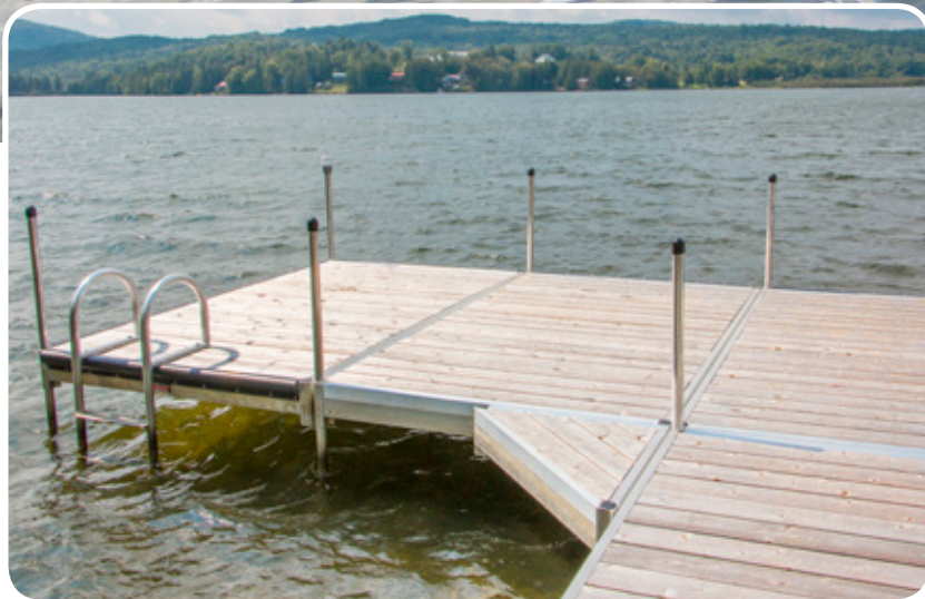
Dock sections installed side by side to create an "L" shape with optional triangle section for more deck space.