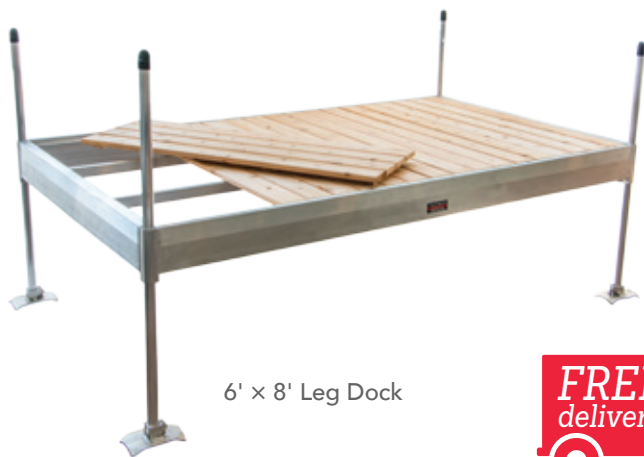
6' x 8' Leg Dock