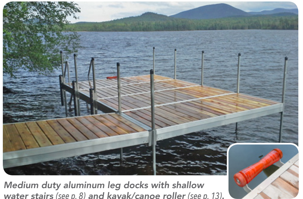
Medium duty aluminum leg docks with shallow water stairs (see p. 8) and kayak/canoe roller (see p. 13).

Easily adjust the height using our winch adjustment kit (sold separately on page 18).