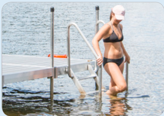
shallow water stairs

Accessory Ideas: see pages 8-19 for full details and more accessory options