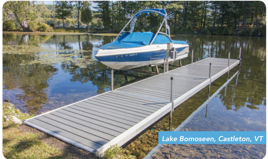
Medium duty aluminum leg docks with NyloDeck® decking.

Complete our site survey on our website and we will send you a free quote and conceptual layout customized to your property. www.thedockdoctors.com/site-survey