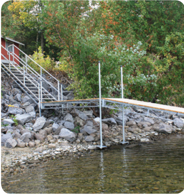
Steel truss leg docks used to transition over a rocky shoreline.