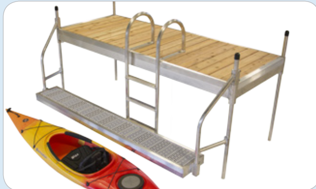
lower access platform shown with aluminum ladder