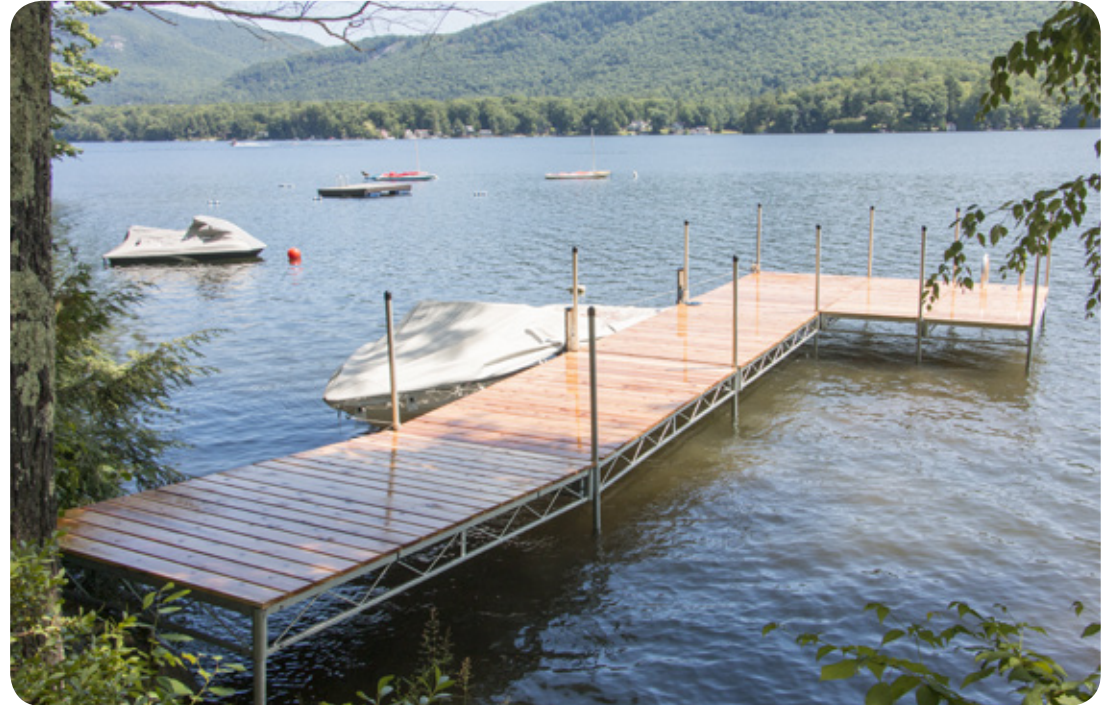
Heavy duty steel truss dock with 6' x 10' sections and cedar decking.