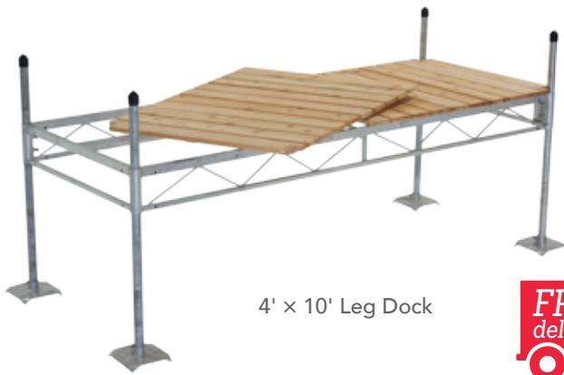
4' x 10' Leg Dock