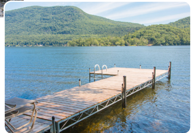
6' wide heavy duty steel truss leg docks with cedar decking and our pipe-mounted vertical fenders (see page 10).