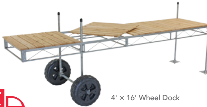
4' x 16' Wheel Dock