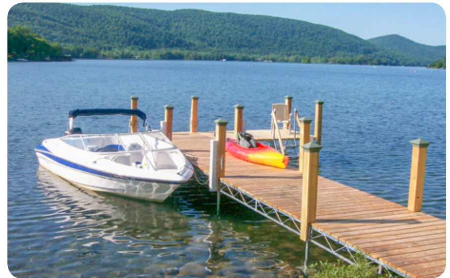
6' wide sections optimize dock space for all your activities - shown with optional cedar post covers (see page 14).