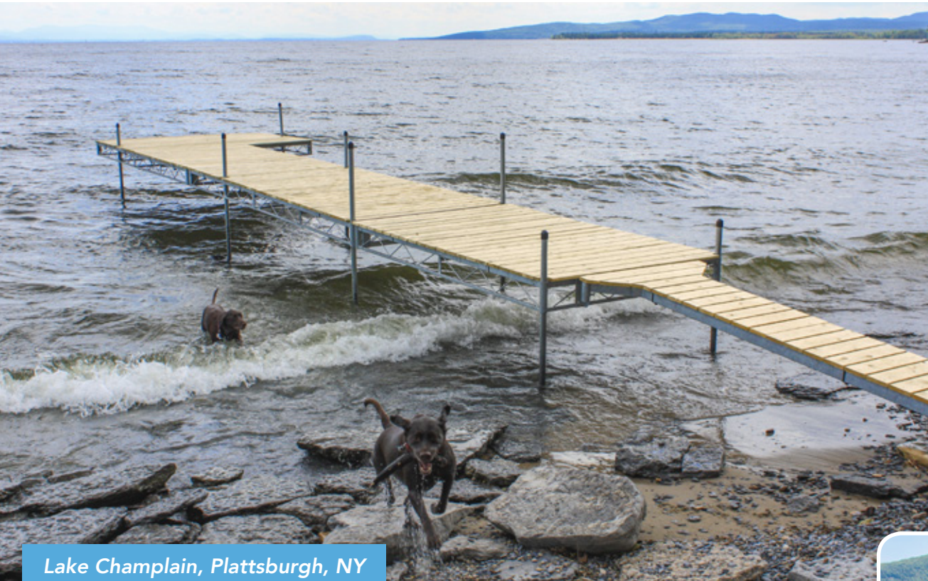
Lake Champlain, Plattsburgh, NY