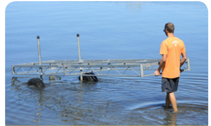
6' wide wheel dock with 4' x 8' "L" section and 2' x 10' catwalk.