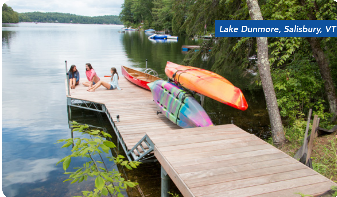
Shoreside pile platform used as shore mount.