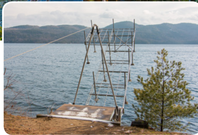
Above: Articulating dock attached to a shoreside platform and a 5,000 lb. hydraulic boat lift.