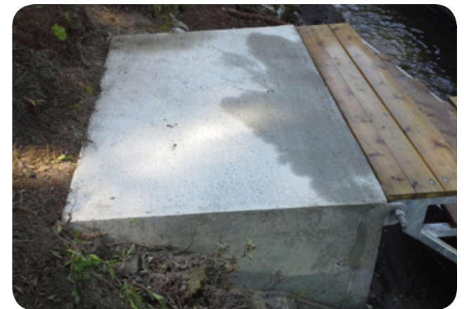
Above: Concrete pad shore mount.