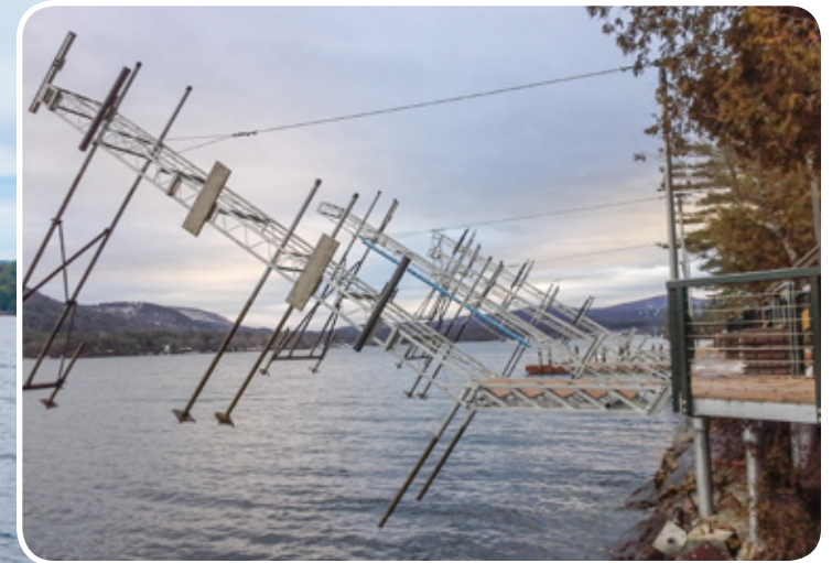
Several articulating docks attached to a shoreside platform at a homeowners association.