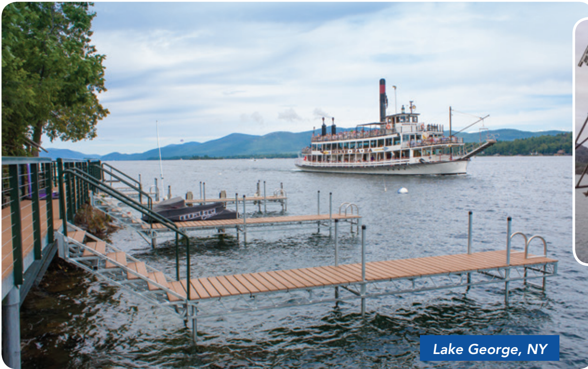
Lake George, NY