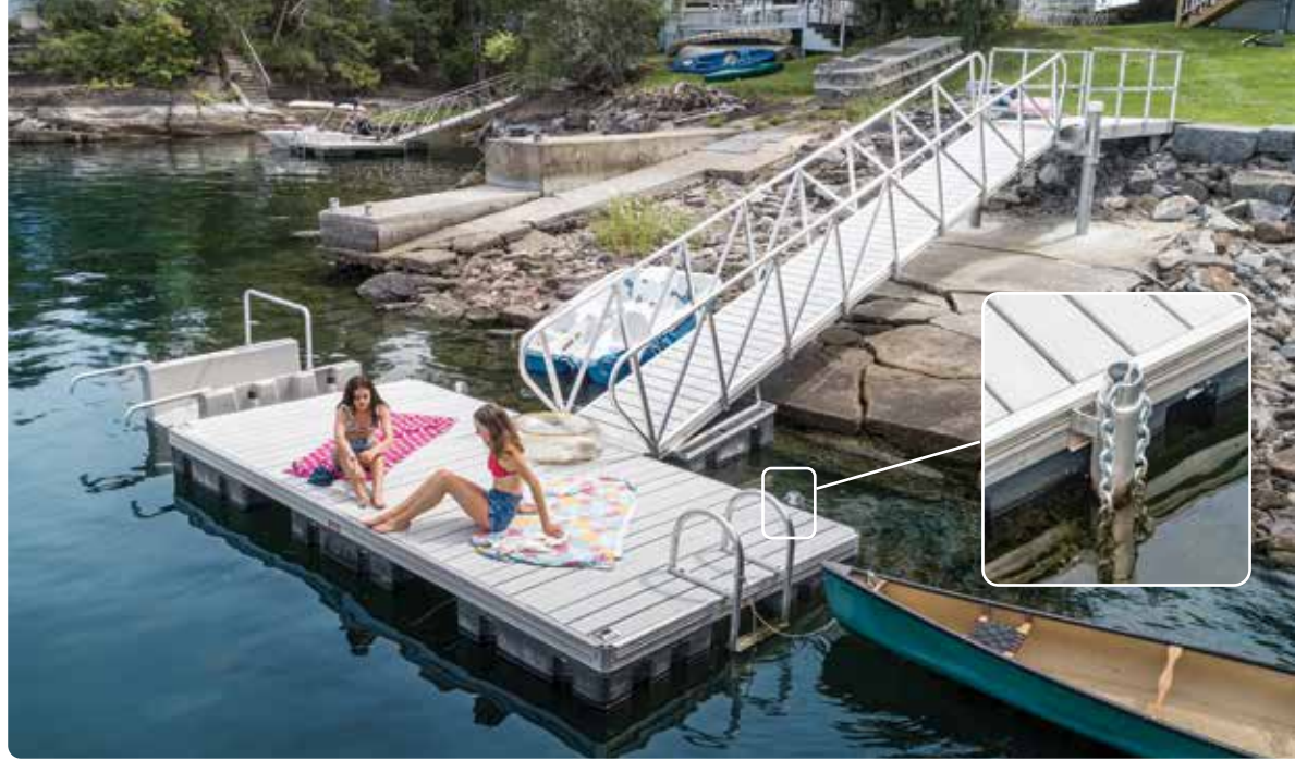
Aluminum floating dock and gangway with WearDeck® decking in barefoot grey. Anchored with our chain tube anchor mount (inset) and our custom pile dock as a shore hitch.