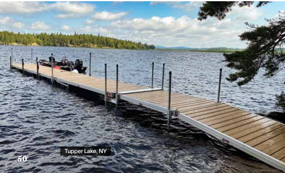
Tupper Lake, NY

Our heavy duty aluminum docks with a 7" tall frame are ideal for sites with more exposure (see pages 4-5 & 51-53 in our Custom Catalog).