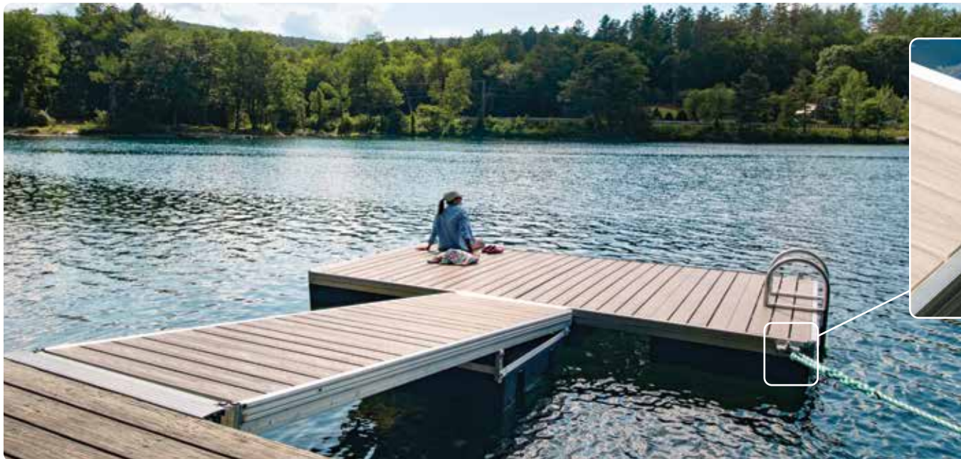
Aluminum floating dock with WearDeck® decking in Weatherwood. Anchored using a hinge connection to existing shoreside deck and slackline to shore.