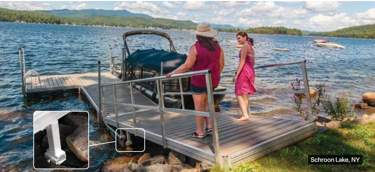
Medium Duty aluminum floating dock with WearDeck decking in weatherwood. Includes custom aluminum handrail and wheel mounts for ease of seasonal installation and removal.