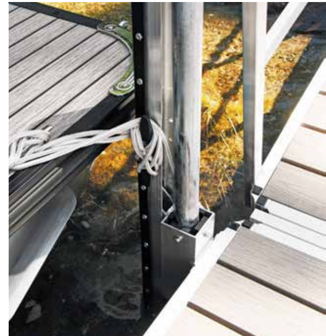
Spud Anchor Mount with Vertical Fender (see p. 11)