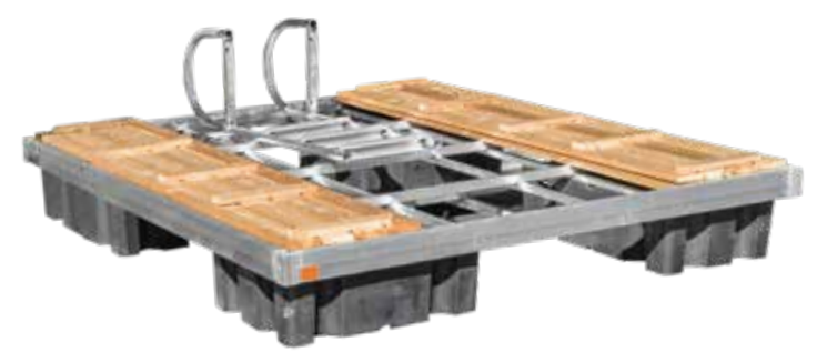
8' × 8' Aluminum Swim Raft

with removable deck panels shown with 3' ladder