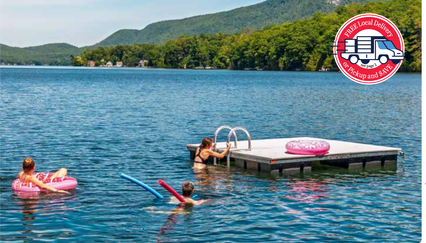
10' × 10' galvanized steel swim raft with WearDeck™ decking and aluminum ladder.