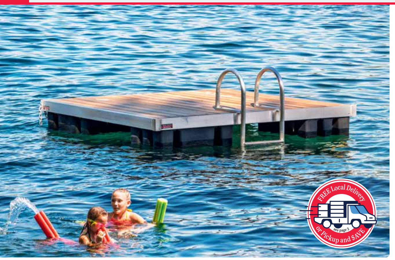
8' × 8' aluminum swim raft with cedar decking and aluminum ladder.