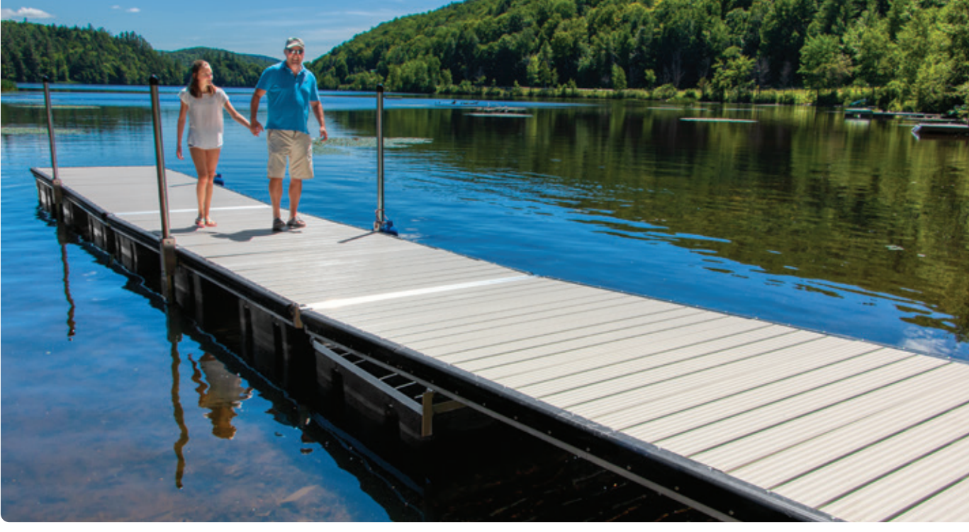
Above: Aluminum floating dock with aluminum decking and optional edge fender.