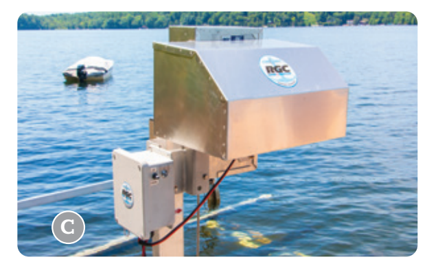
Direct A/C drive with manual switch