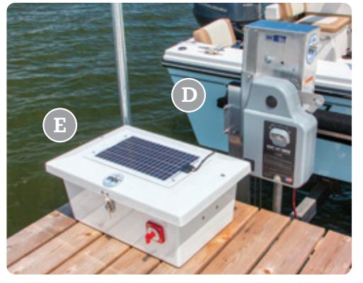
Extreme Max D/C drive with remote control and solar power box