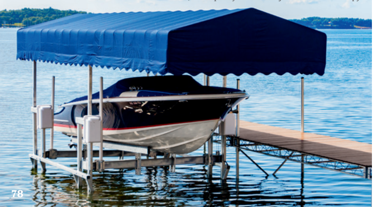
18,000 capacity Ultimate Lift with custom canopy.