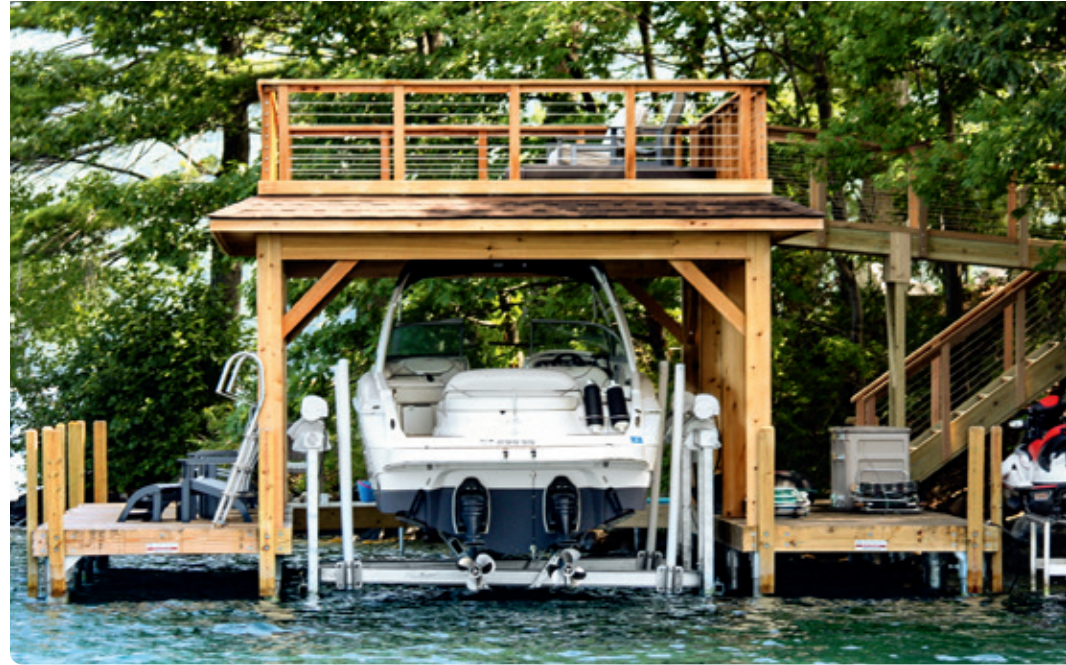
Above: 12,000 lb. capacity Ultimate Lift installed in a slip within a boathouse with standard vertical guides & upgraded oil bath drives.