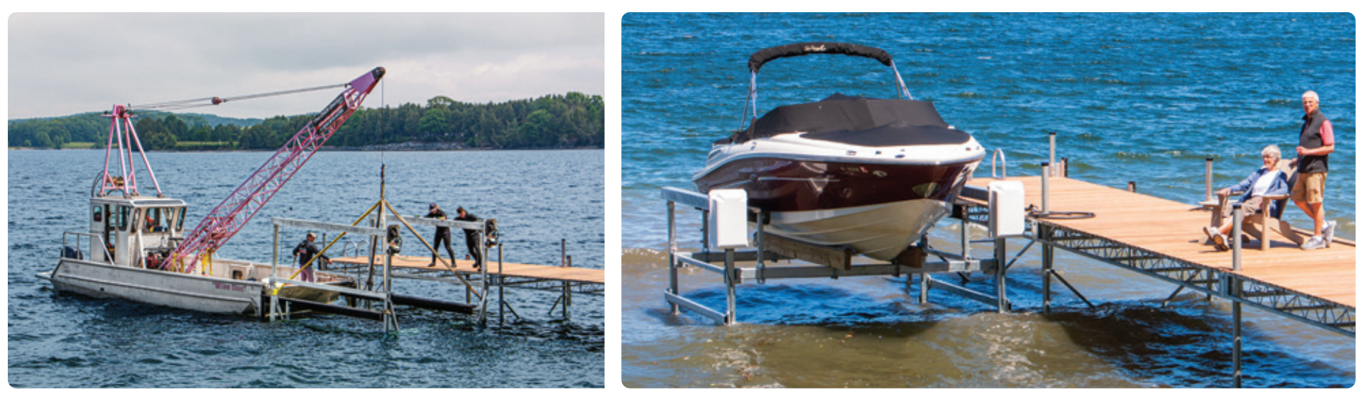
Above Left: 6000 lb. capacity Ultimate Lift being installed with our workboat "Miss Doc" and service crew.