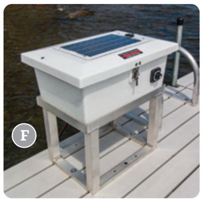
Elevated power box stand