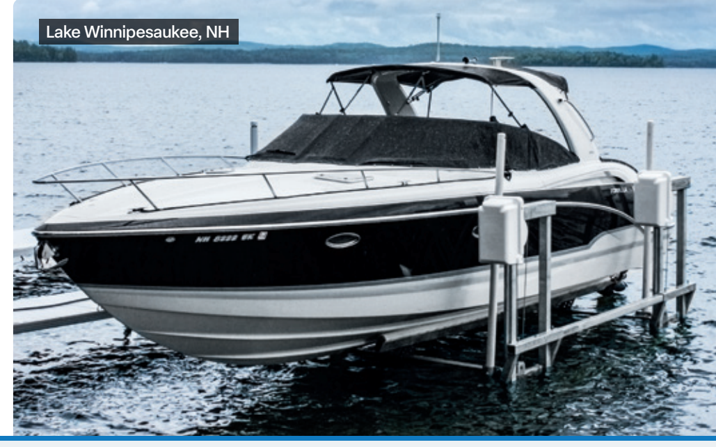
2024 Catalog / Boat Lifts 77

The Dock Doctors 1-800-870-6756 www.thedockdoctors.com