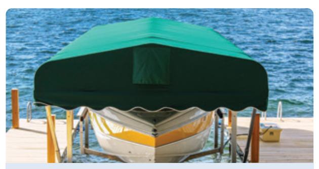
Traditional canopy shown above. Please visit our website for other style options available: www.thedockdoctors.com/canopies

* Guides for 12K lift model are available in aluminum and vinyl only.